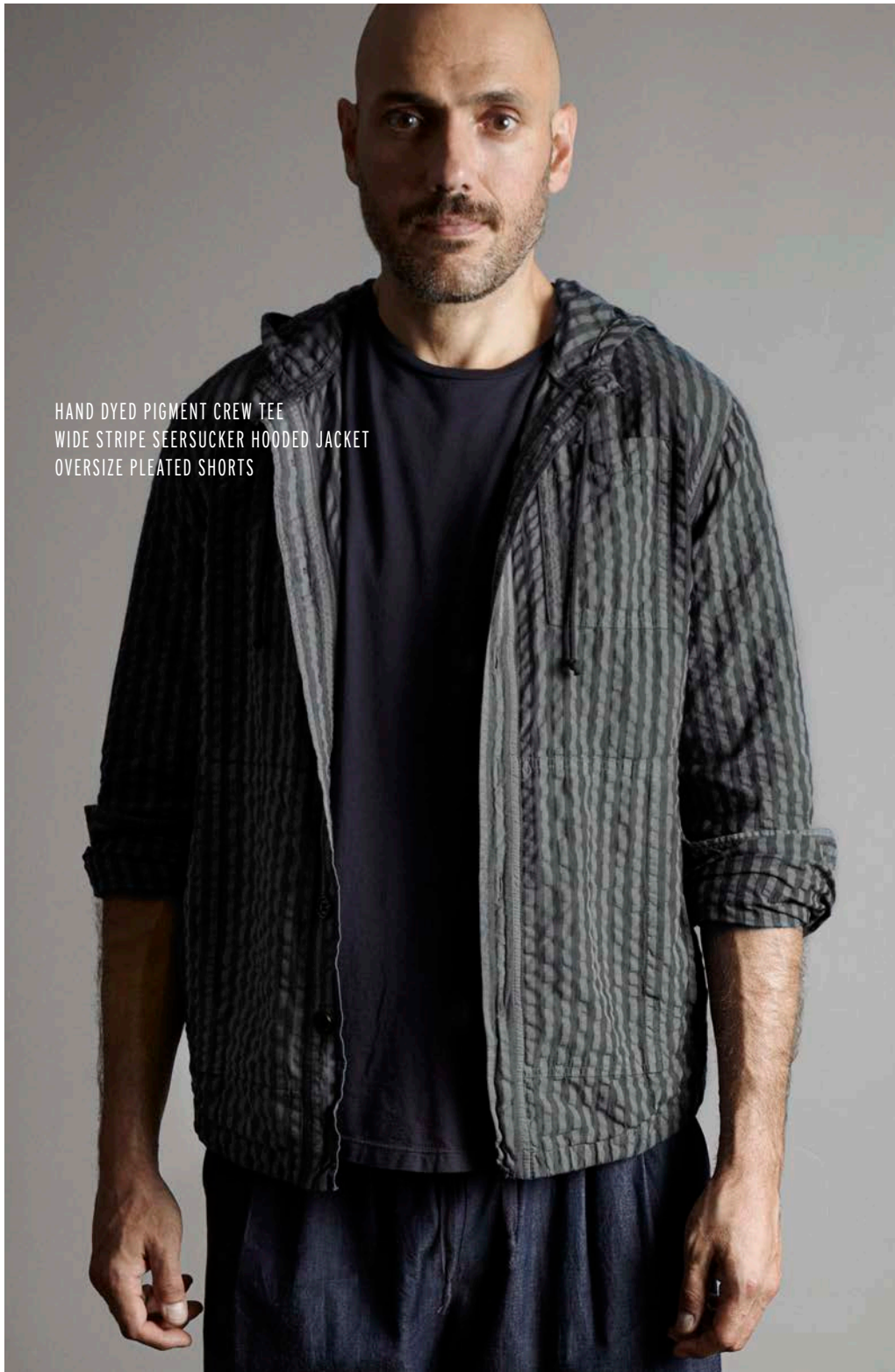
HAND DYED PIGMENT CREW TEE WIDE STRIPE SEERSUCKER HOODED JACKET OVERSIZE PLEATED SHORTS