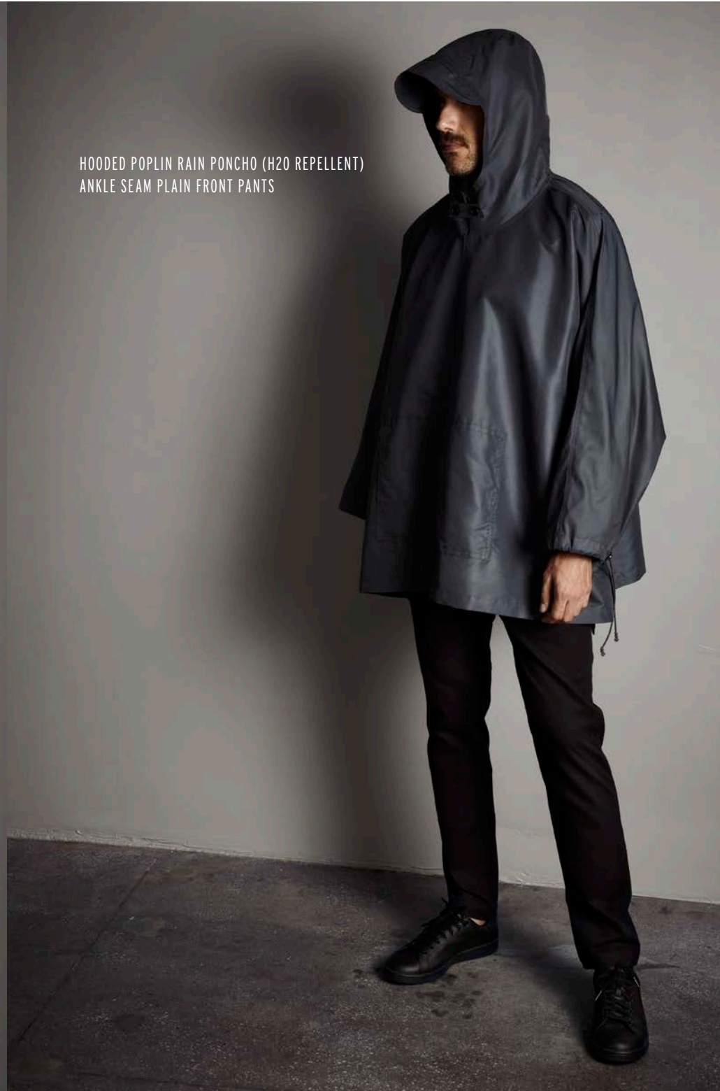
HOODED POPLIN RAIN PONCHO (H2O REPELLENT) ANKLE SEAM PLAIN FRONT PANTS