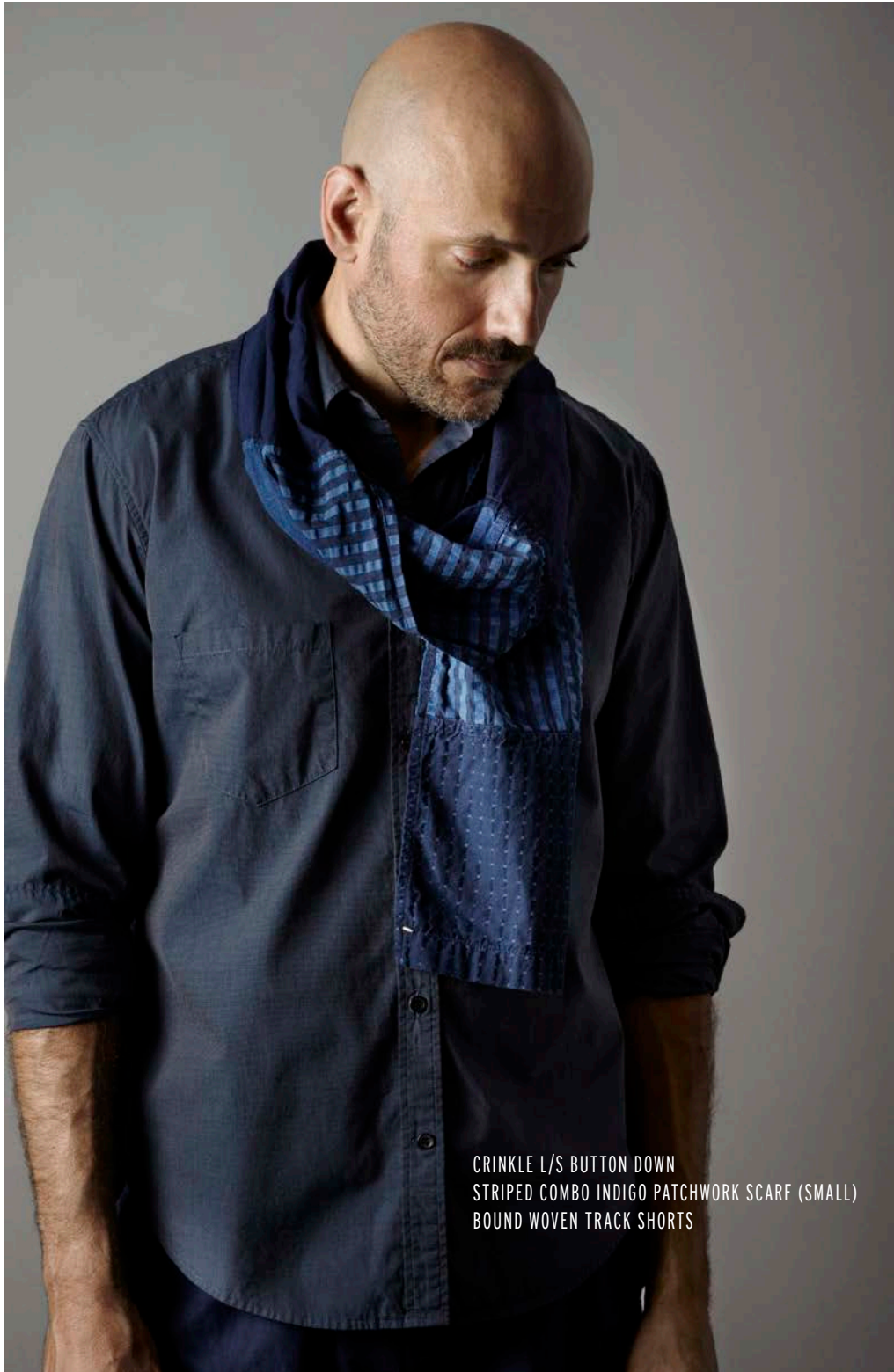
CRINKLE L/S BUTTON DOWN STRIPED COMBO INDIGO PATCHWORK SCARF (SMALL) BOUND WOVEN TRACK SHORTS