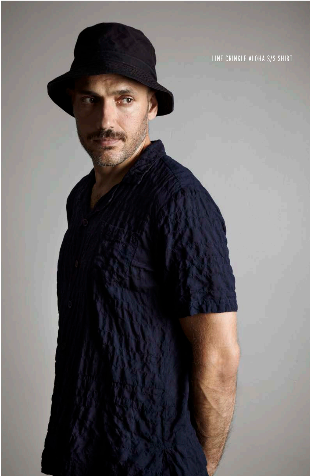
LINE CRINKLE ALOHA S/S SHIRT