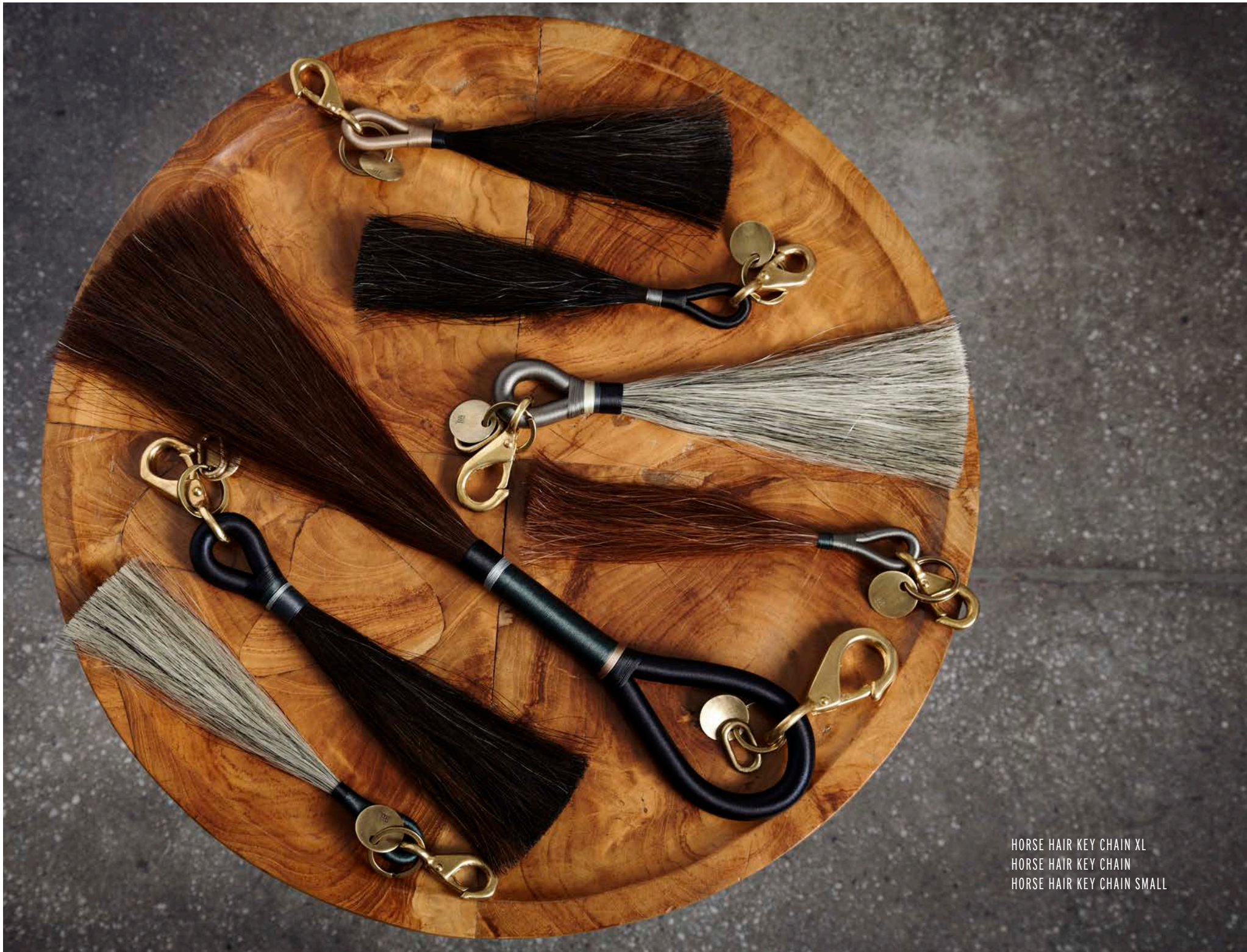
HORSE HAIR KEY CHAIN XL HORSE HAIR KEY CHAIN HORSE HAIR KEY CHAIN SMALL