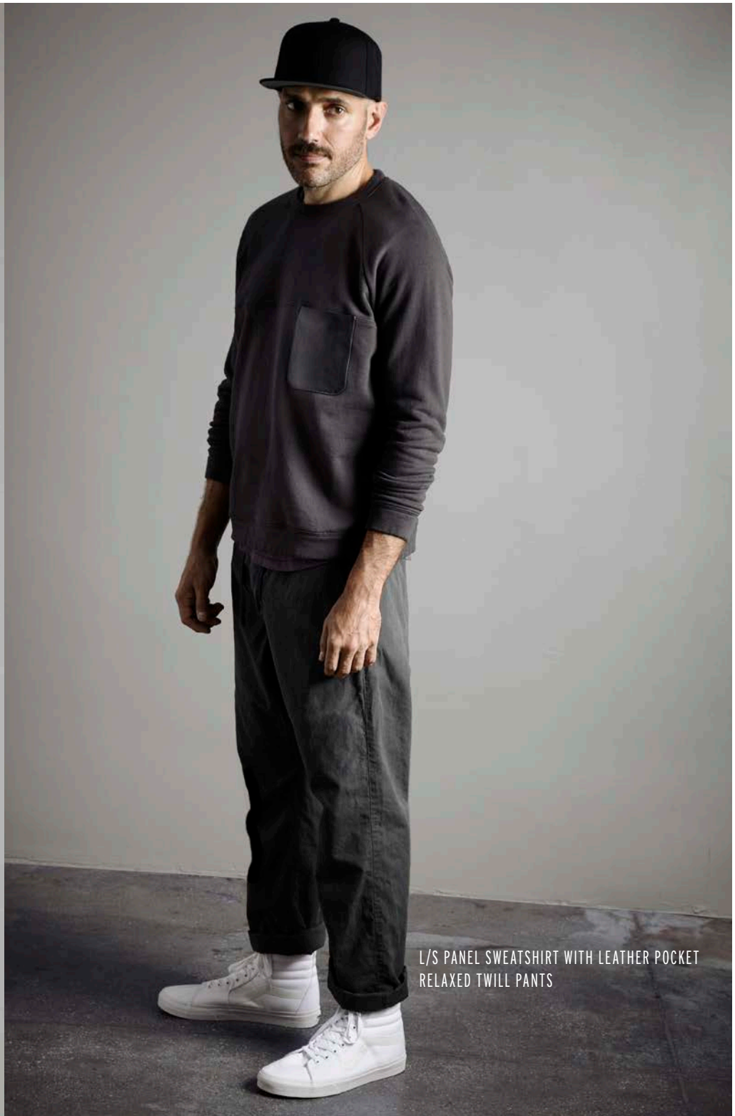
L/S PANEL SWEATSHIRT WITH LEATHER POCKET RELAXED TWILL PANTS