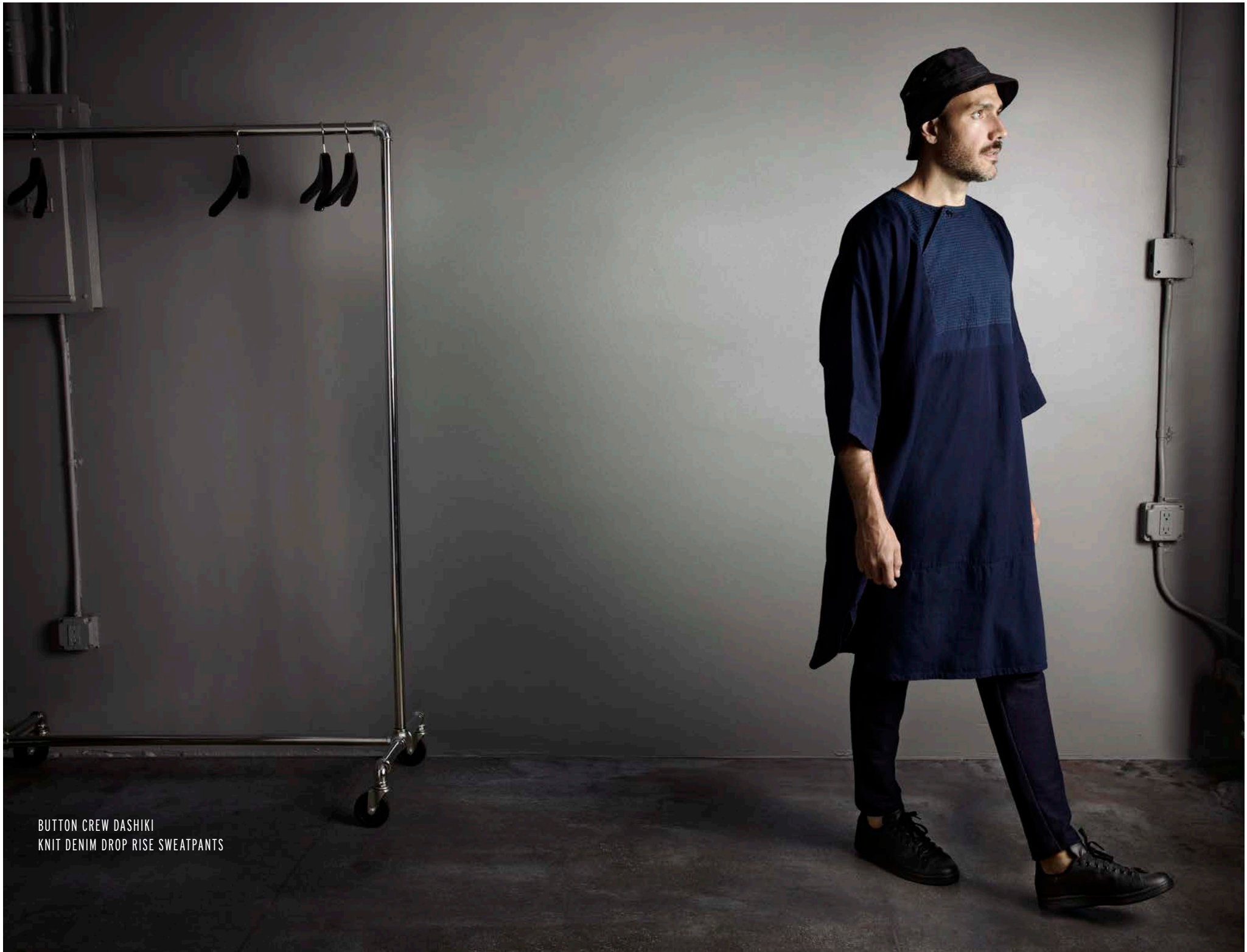
BUTTON CREW DASHIKI KNIT DENIM DROP RISE SWEATPANTS