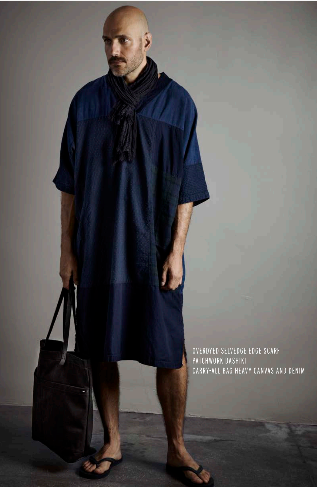
OVERDYED SELVEDGE EDGE SCARF PATCHWORK DASHIKI CARRY-ALL BAG HEAVY CANVAS AND DENIM