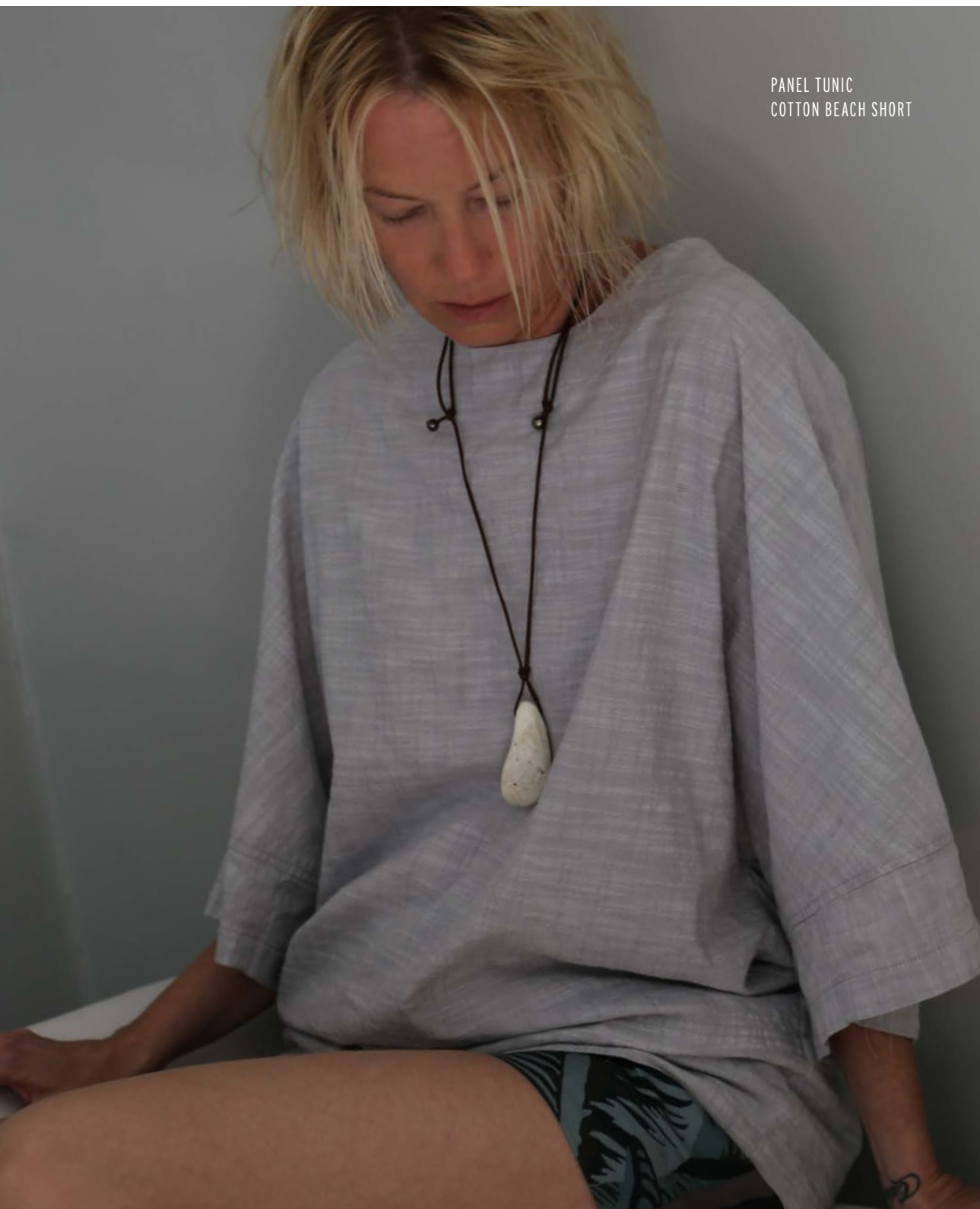
PANEL TUNIC COTTON BEACH SHORT