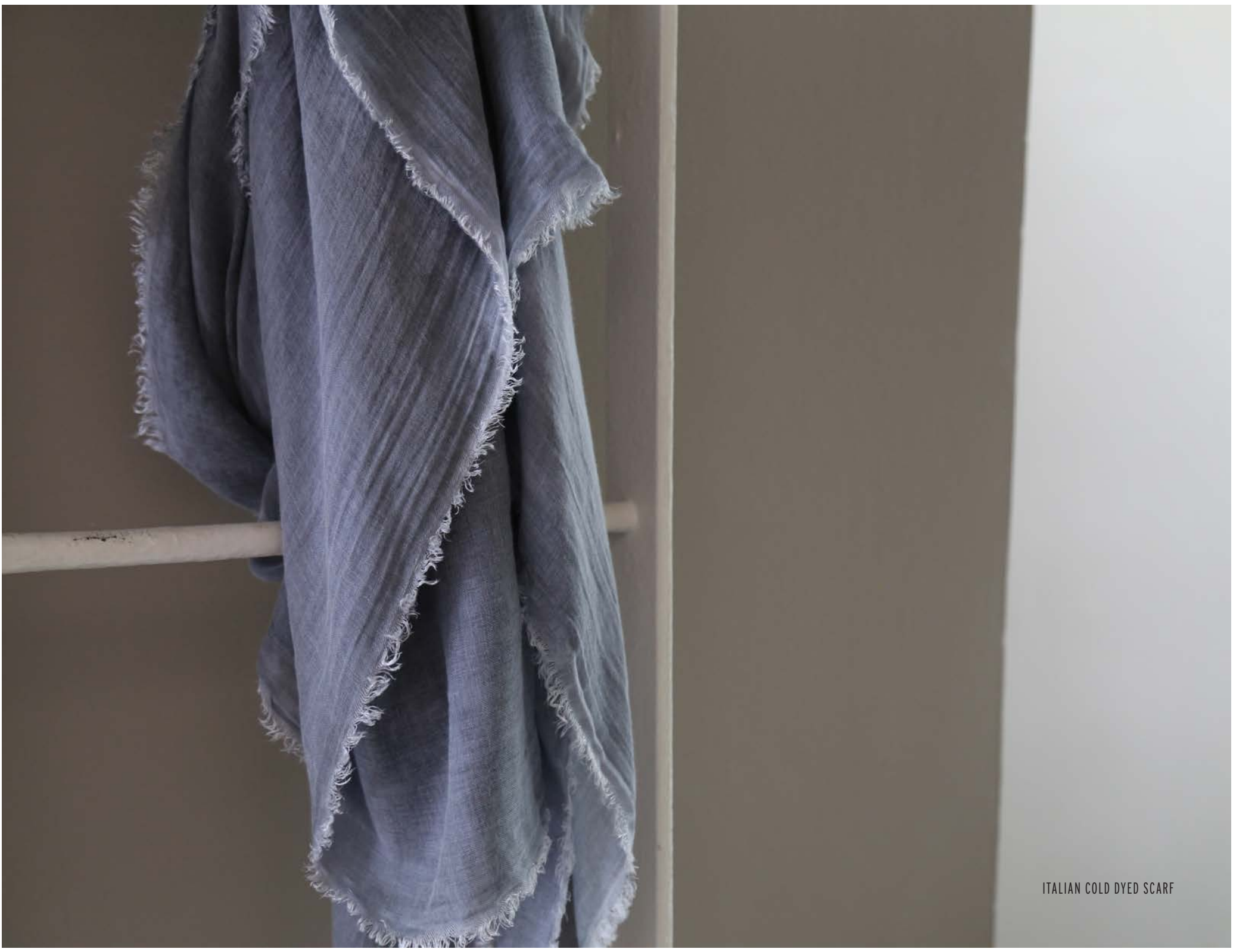
ITALIAN COLD DYED SCARF