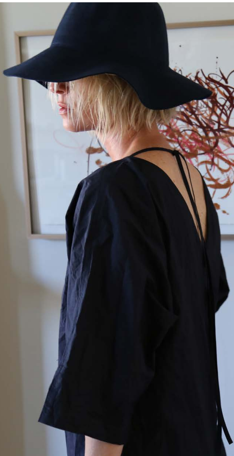
CRINKLE V-BACK JUMPSUIT