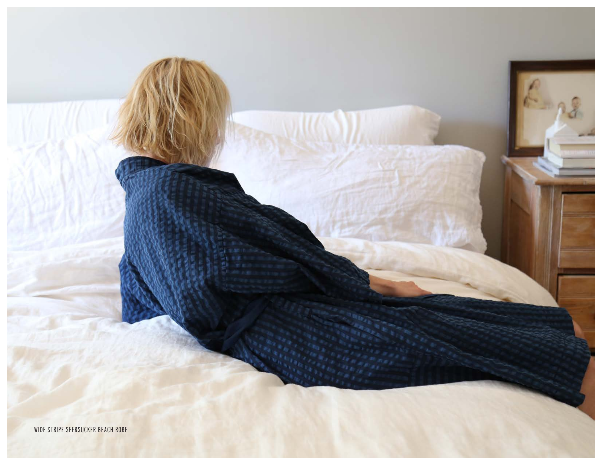
WIDE STRIPE SEERSUCKER BEACH ROBE