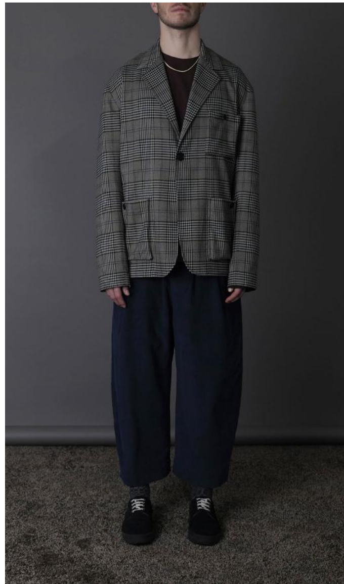
SACK POCKET ONE-BUTTON JACKET / PLAID SUITING