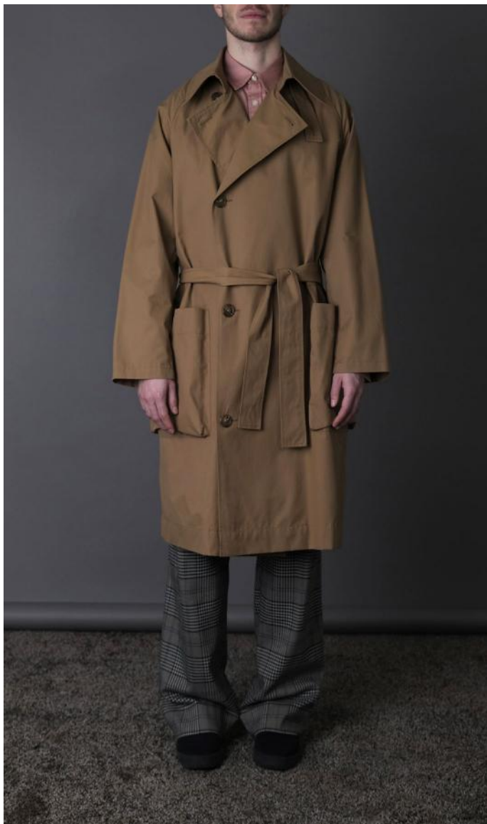
PEAKED LAPEL TRENCH COAT / RESIST TWILL