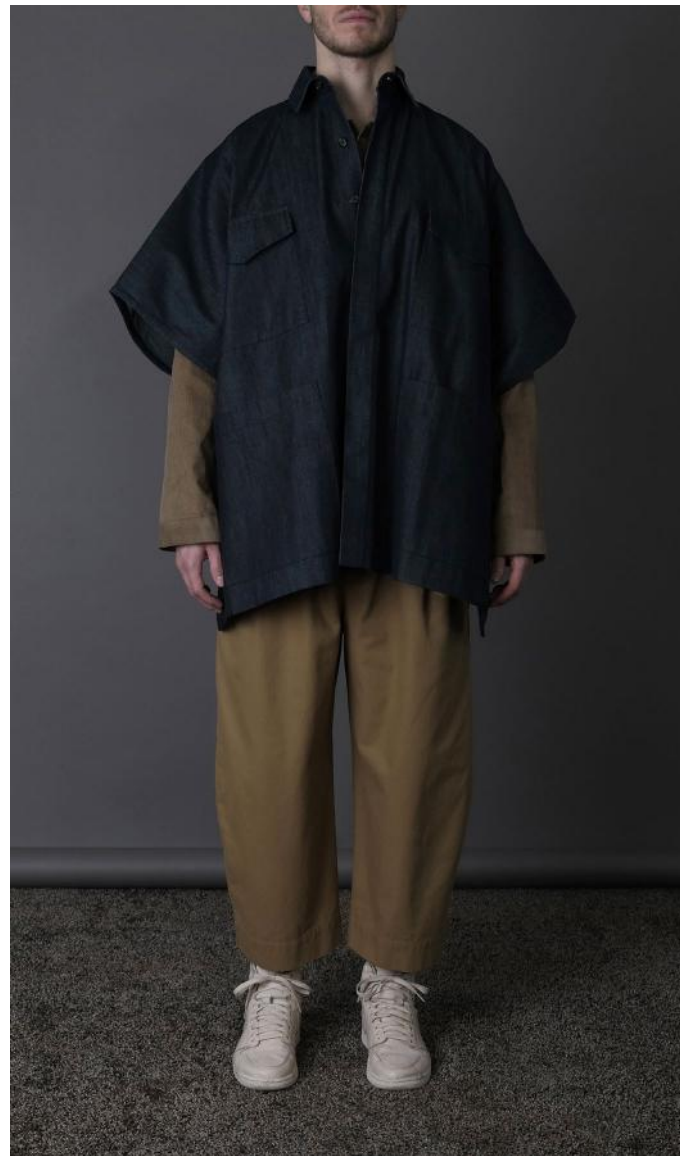
4 POCKET SHIRT PONCHO / RAW DENIM