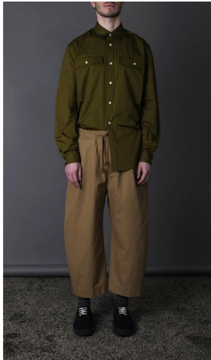
OVATE BAGGY PANT / CANVAS