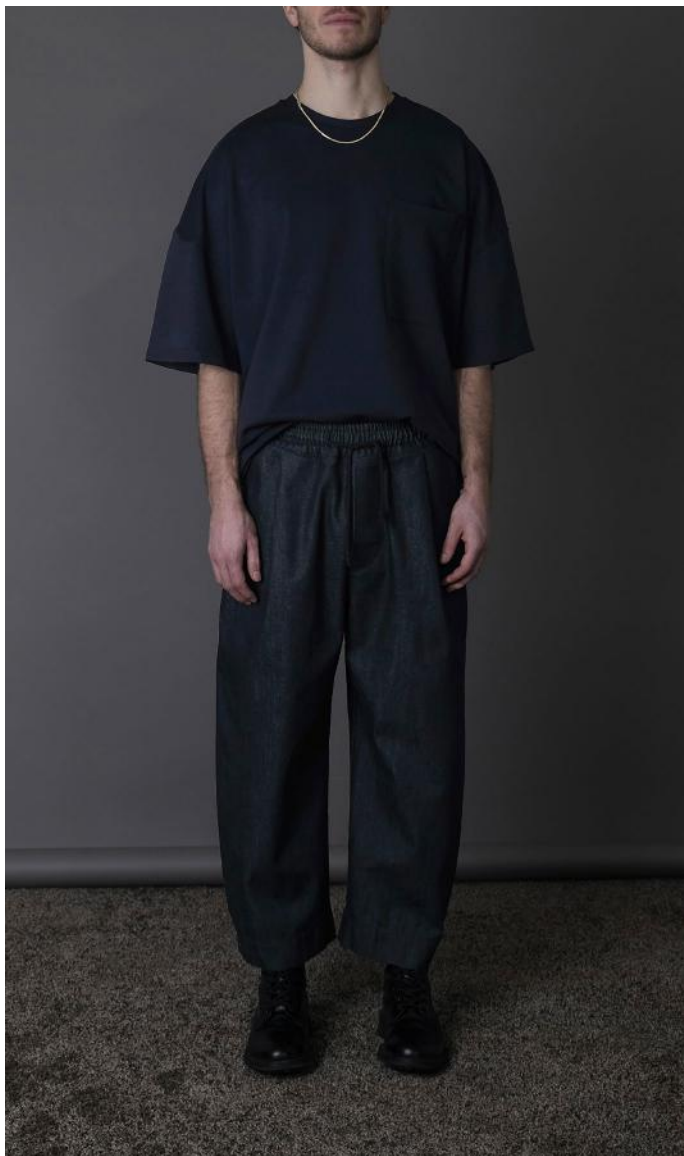
OVATE BAGGY PANT / RAW DENIM