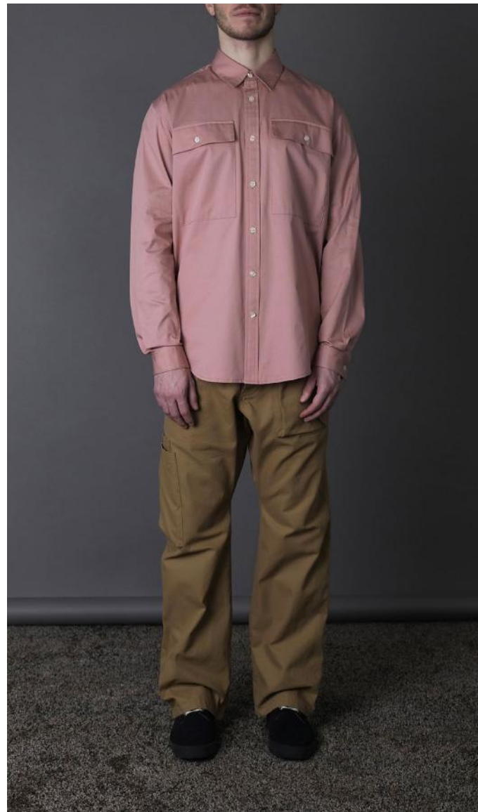
L/S TWOFOLD POCKET SHIRT / FINE TWILL