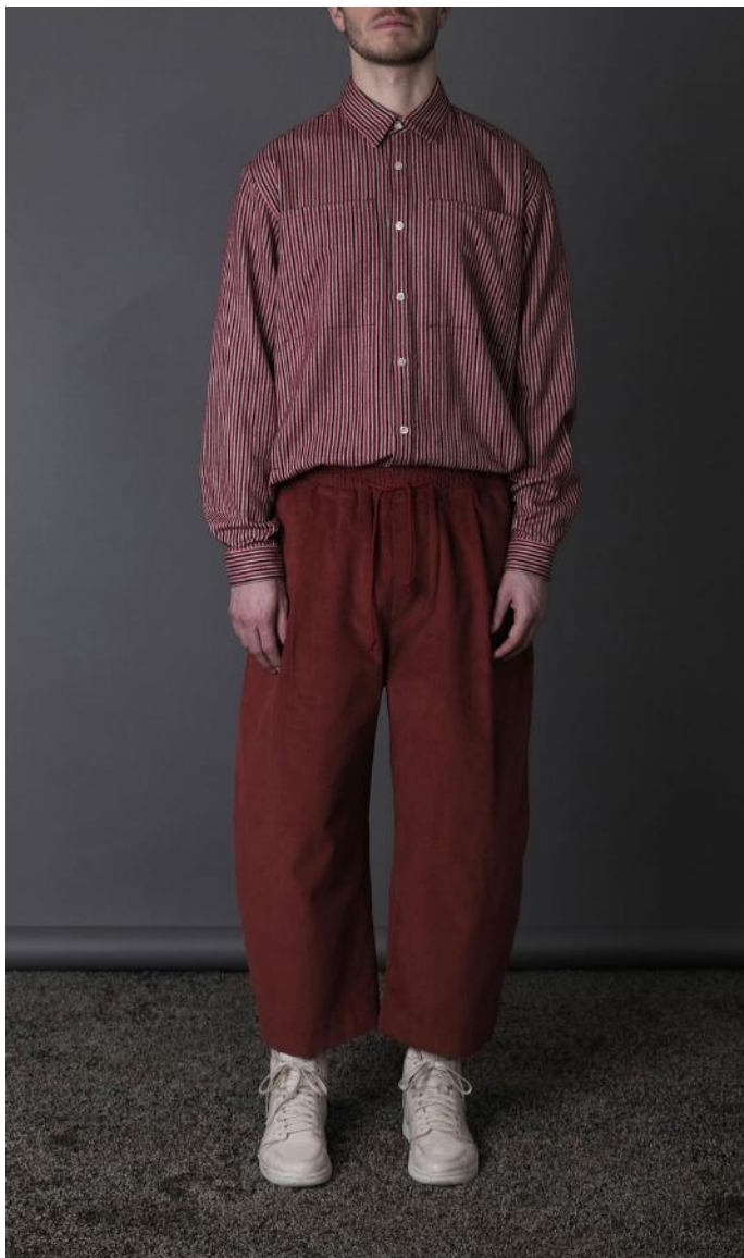
OVATE BAGGY PANT / CORDUROY