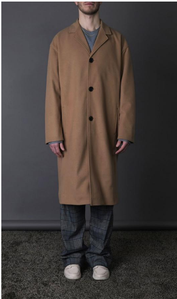
RELAXED ERRAND OVERCOAT / BRUSHED FLANNEL