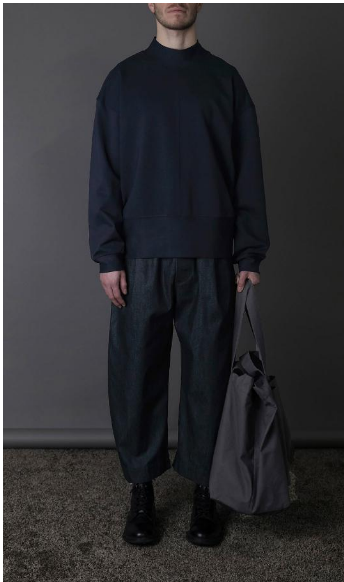
MOCK NECK PULLOVER / MEMORY KNIT