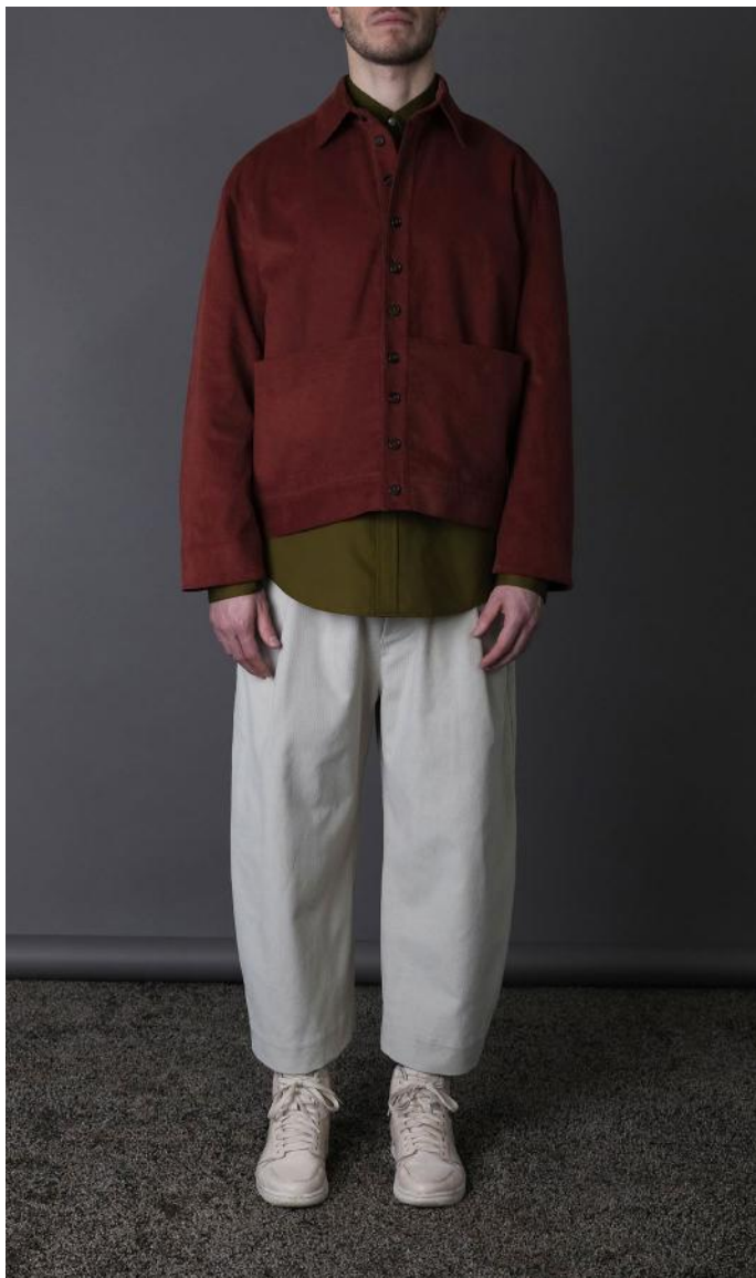
CROPPED 'SHORTY' SHIRT JACKET / CORDUROY