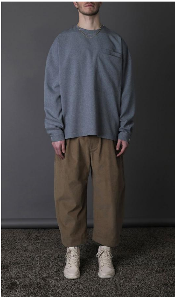
L/S WOVEN CREW SHIRT / BALANCE WEAVE