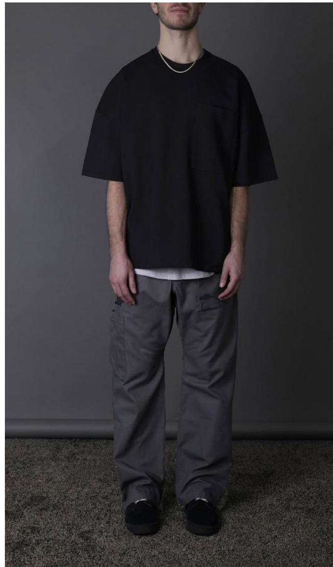
OVERIZED KNIT CREW / MEMORY KNIT