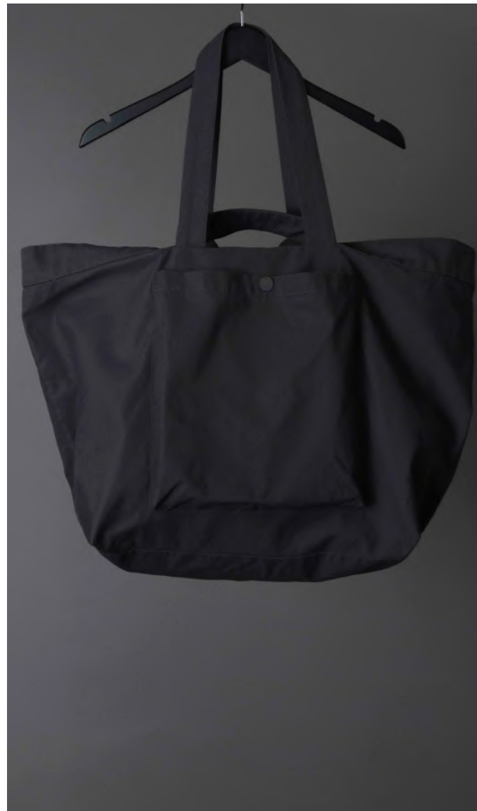
SLOUCHY TOTE / CANVAS