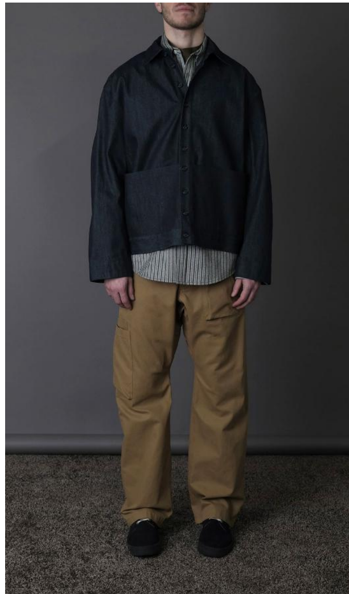
CROPPED 'SHORTY' SHIRT JACKET/ RAW DENIM