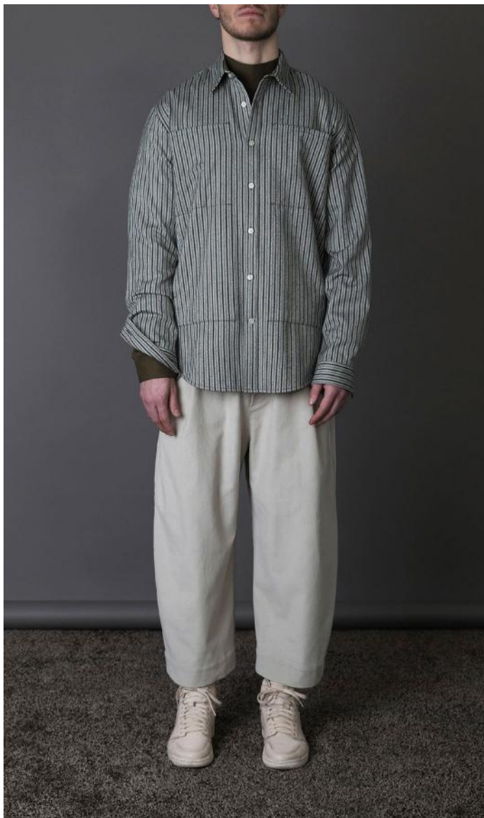
L/S RELAXED 4 POCKET SHIRT / FLANNEL STRIPE