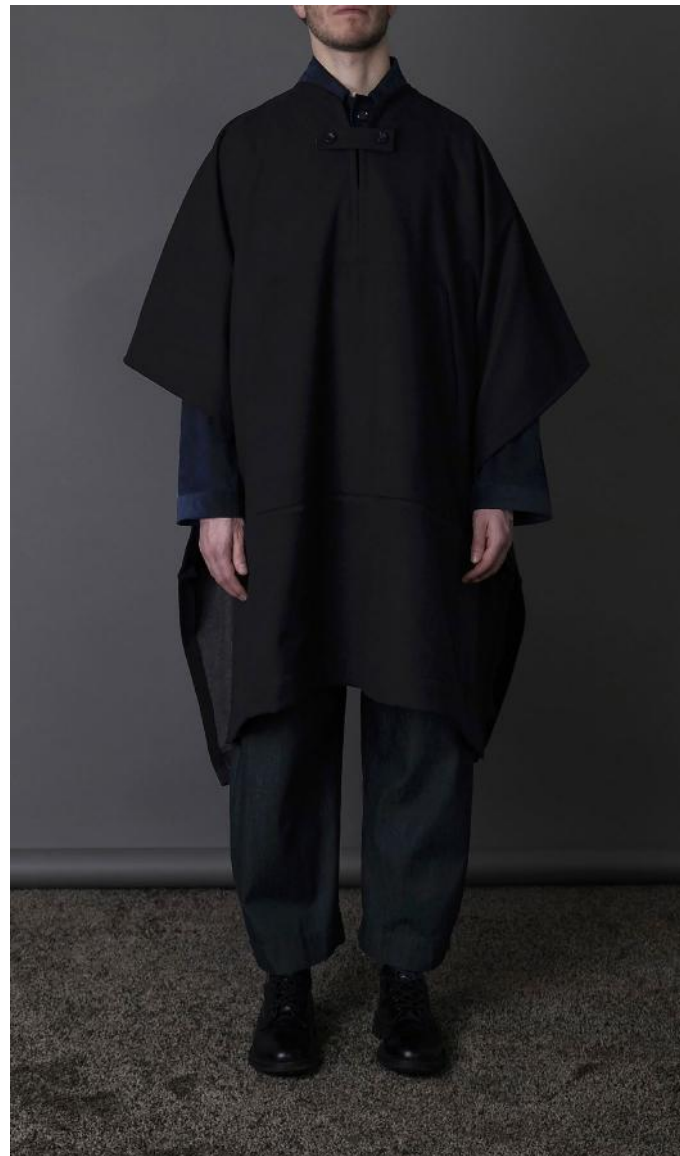
PULLOVER NOMAD PONCHO / BRUSHED FLANNEL