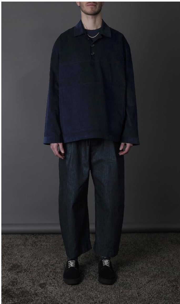
POPOVER MESSENGER JACKET / CORDUROY