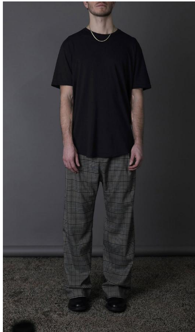
HAND PIGMENT DYED CREW / FINE JERSEY