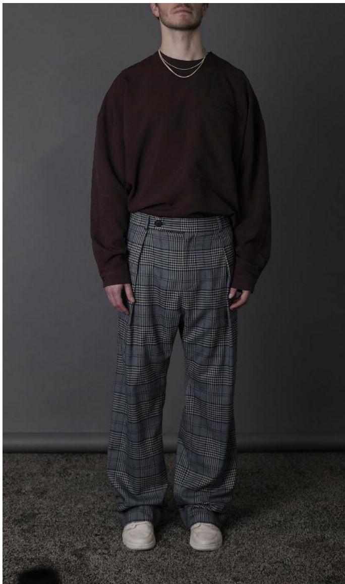
IN-FOLD ROOMY TROUSER / PLAID SUITING