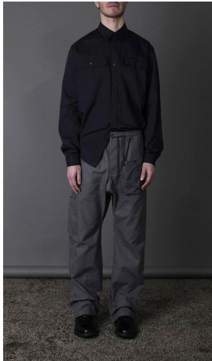
RELAXED UTILITY PANT / CANVAS