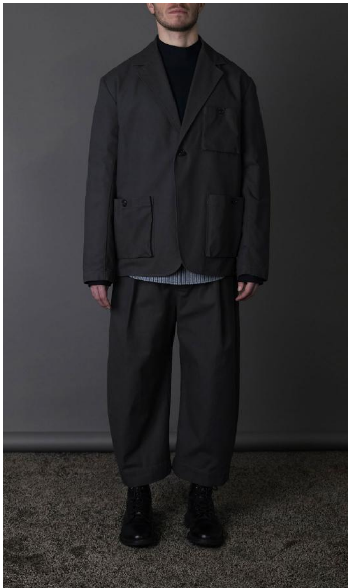
SACK POCKET ONE-BUTTON JACKET / CANVAS