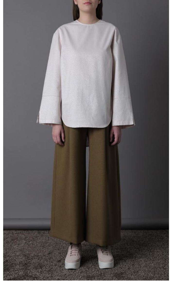
KEY HOLE CREW SHIRT / FLASH CLOTH