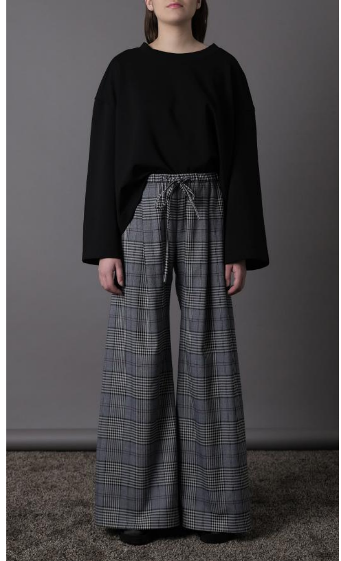
WIDE EASY PANT / PLAID SUITING