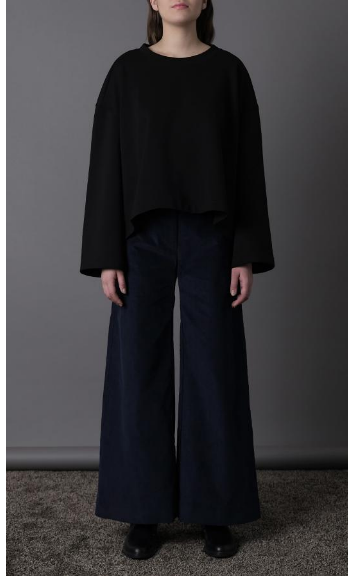
L/S OVERSIZED TEE / PONTE MEMORY KNIT