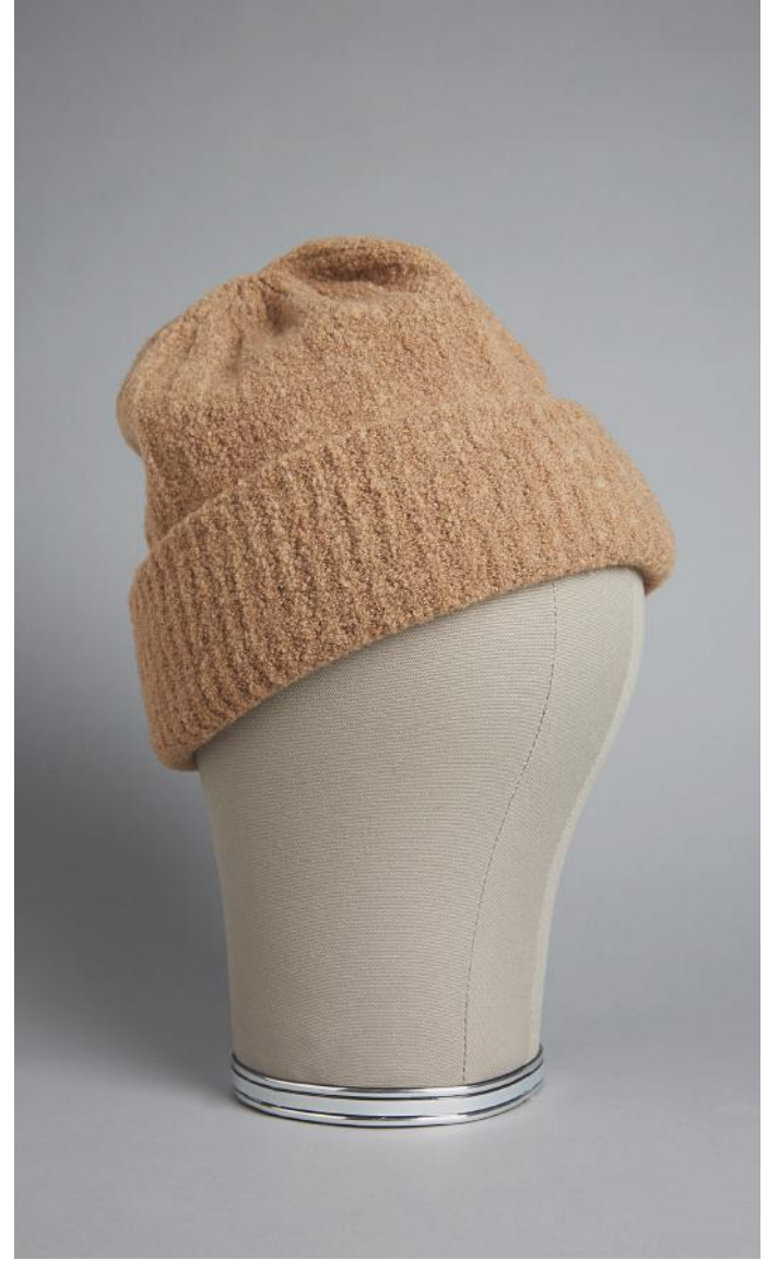
MOUSSE DOIUBLE-SIDED BEANIE