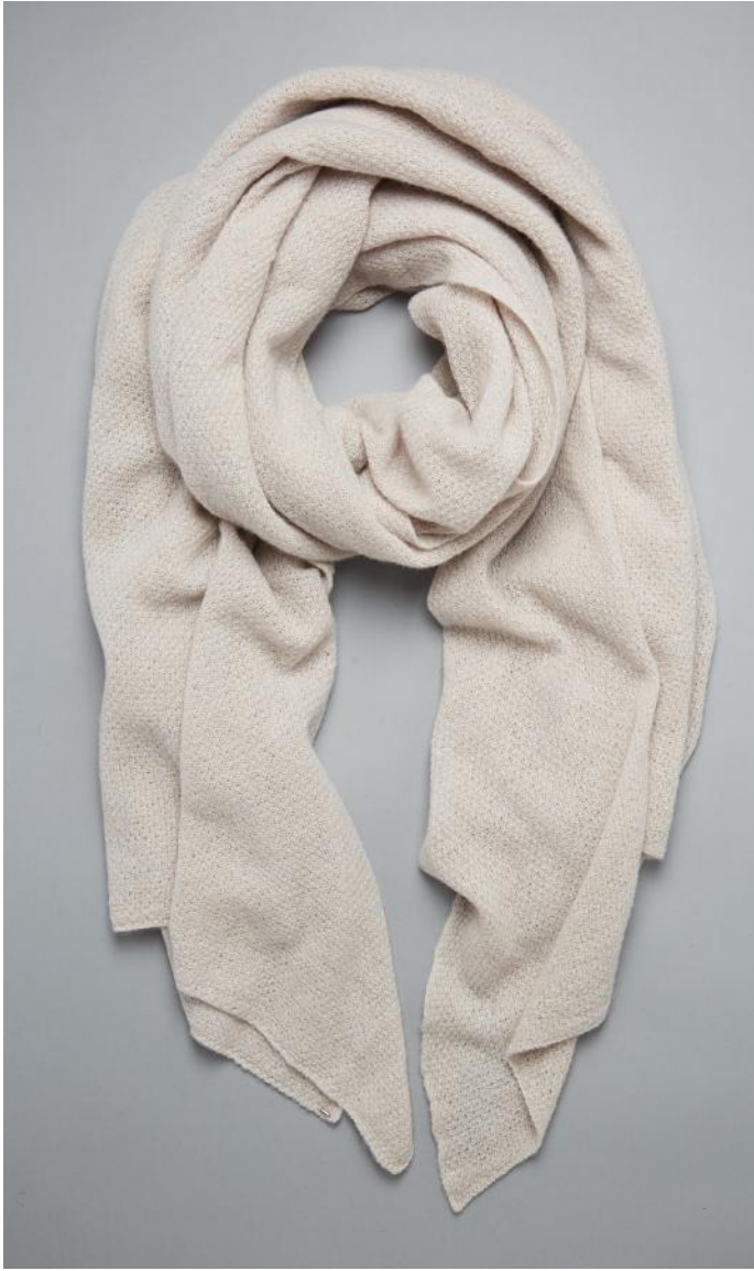
CASHMERE BLEND MOSS STITCH GIANT SCARF