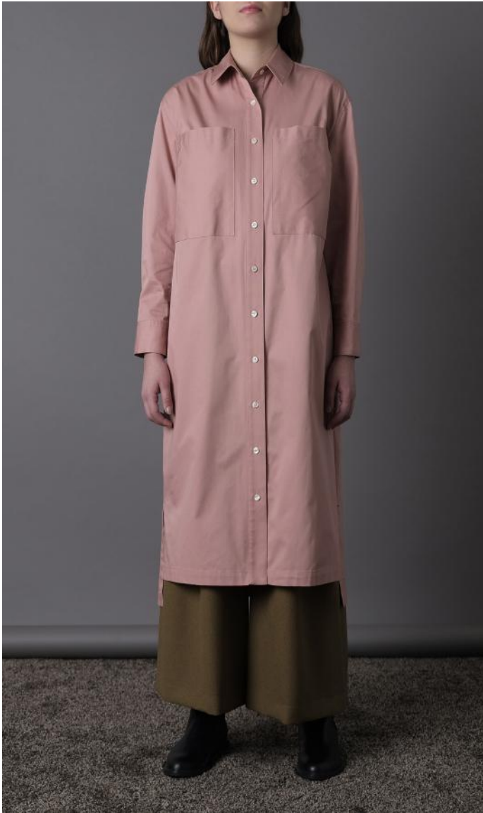
TWO POCKET SHIRT DRESS / FINE TWILL