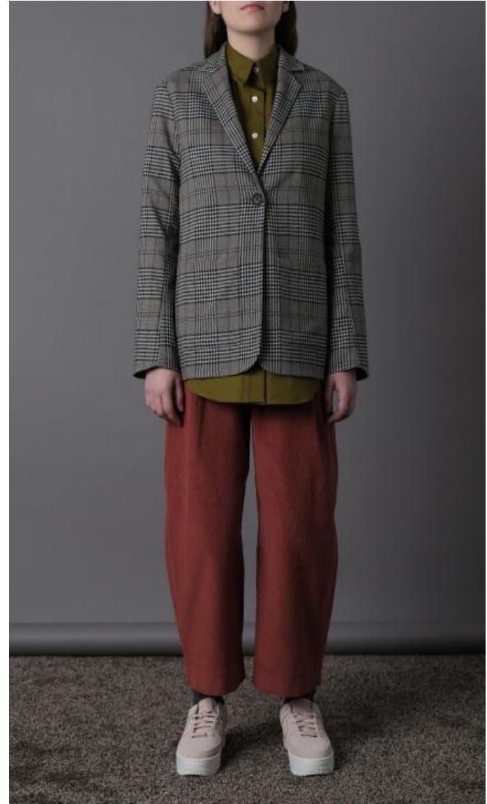
ONE BUTTON SUIT JACKET / PLAID SUITING