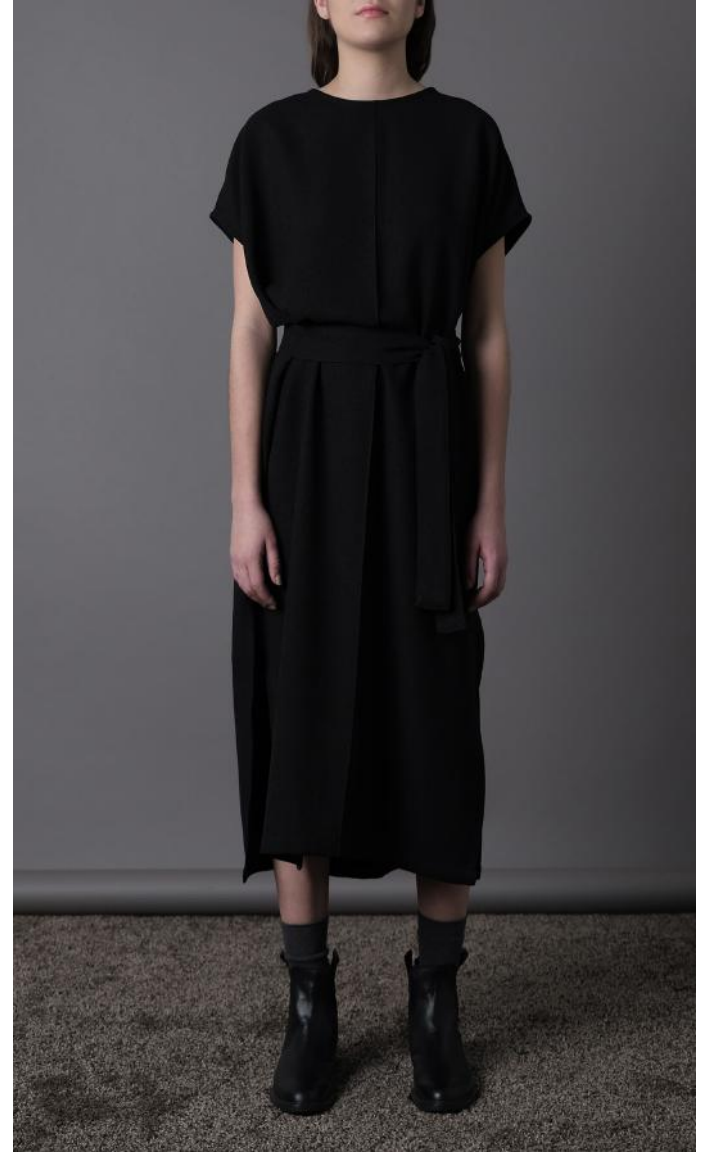
CHITON TIE DRESS / CREPE