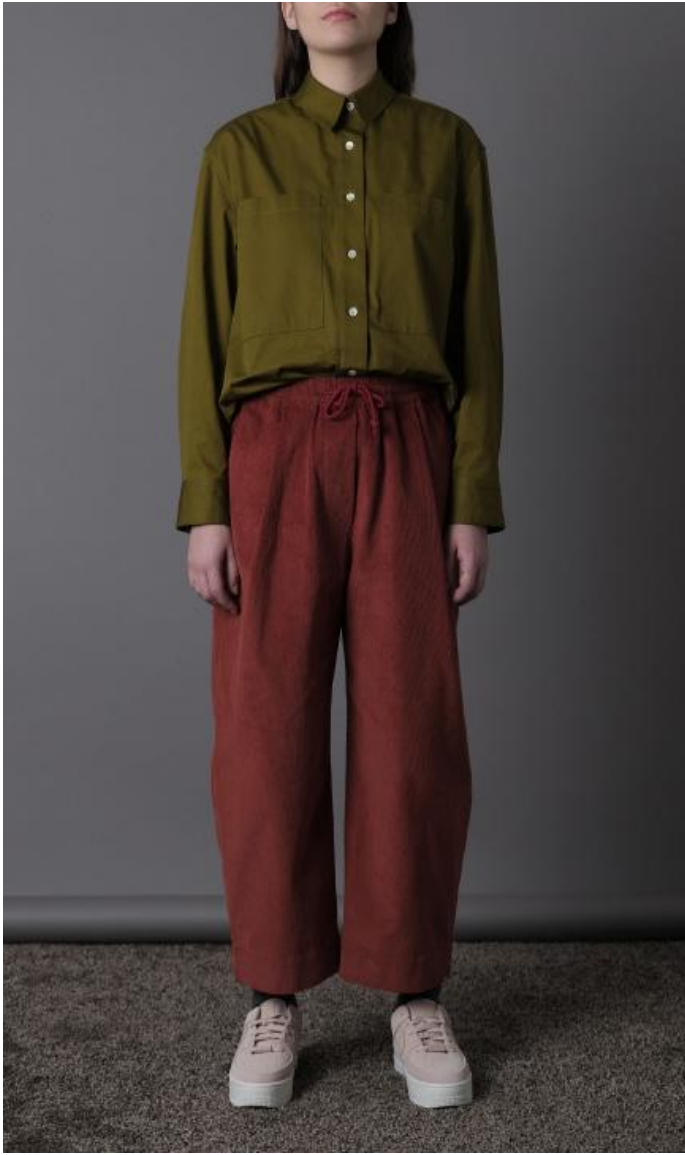
OVATE BAGGY PANT / CORDUROY