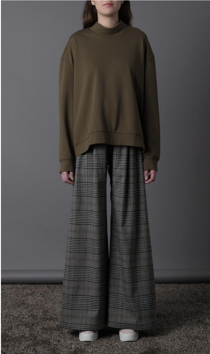
MOCK NECK OVERSIZED PULLOVER / PONTE MEMORY KNIT