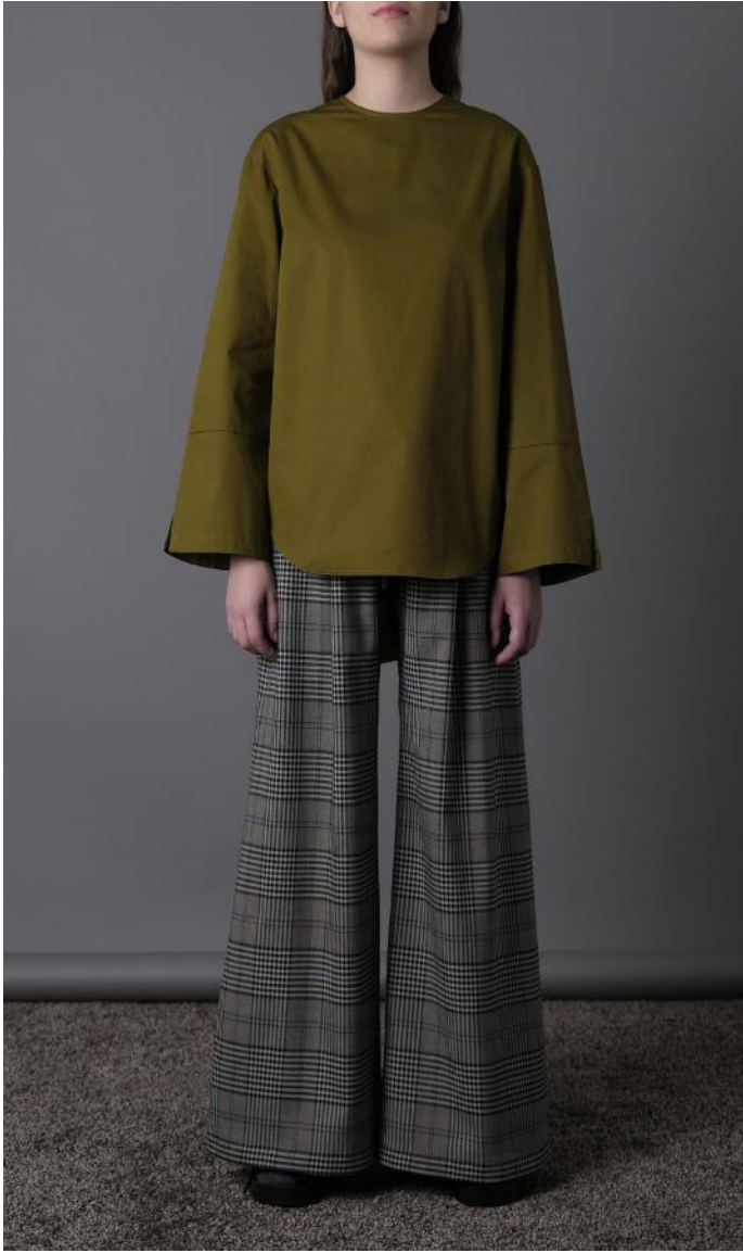
KEY HOLE CREW SHIRT / FINE TWILL