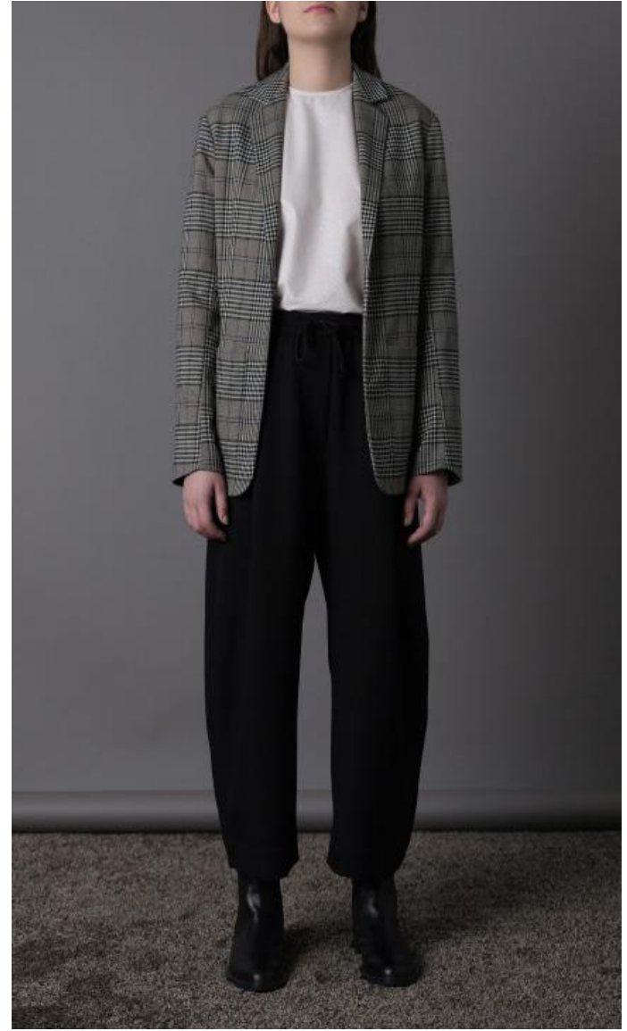
OVATE BAGGY PANT / CREPE