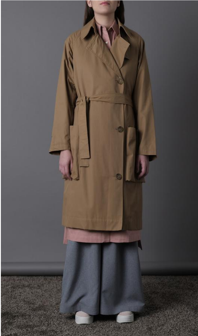
PEAKED LAPEL TRENCH COAT / RESIST TWILL