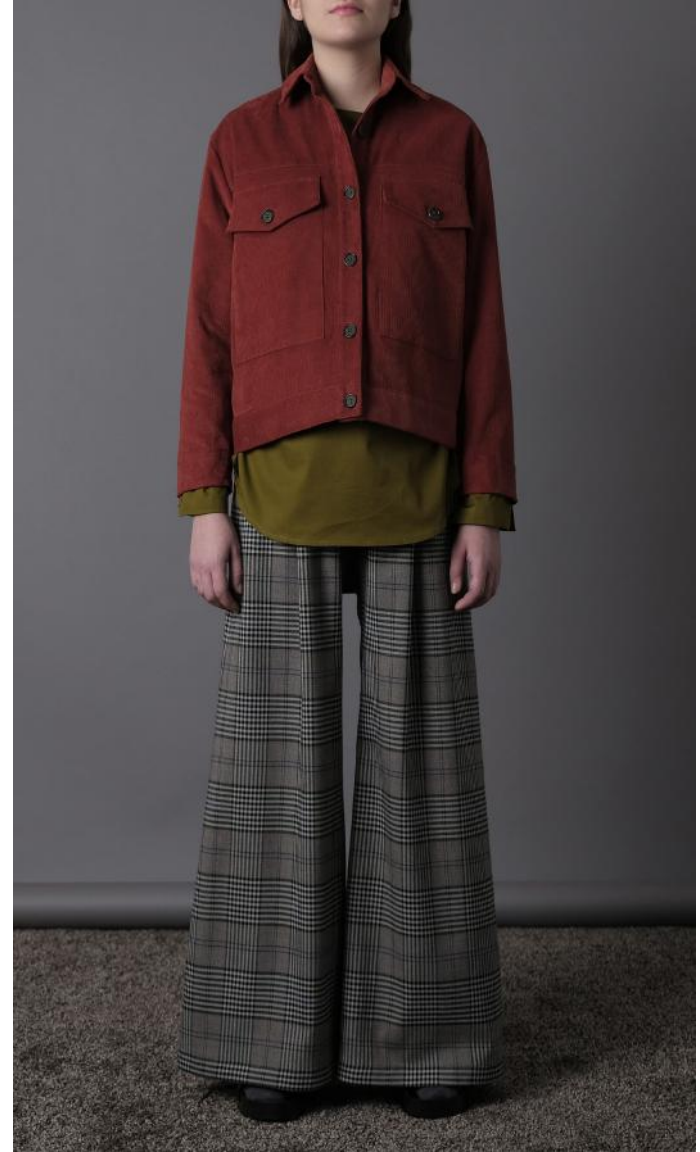
TWO POCKET CROPPED JACKET / CORDUROY