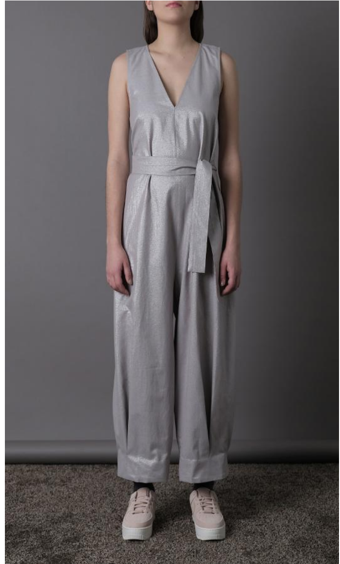
JEAN GENIE JUMPSUIT / FLASH CLOTH