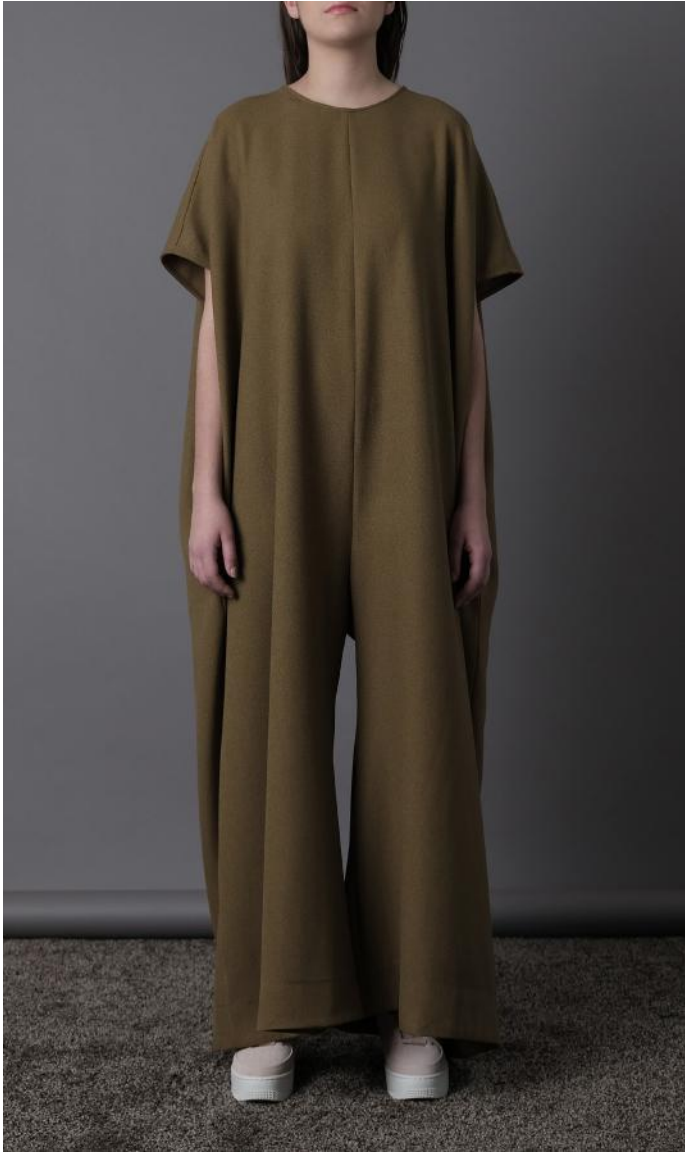
THE BOX JUMPSUIT / CREPE