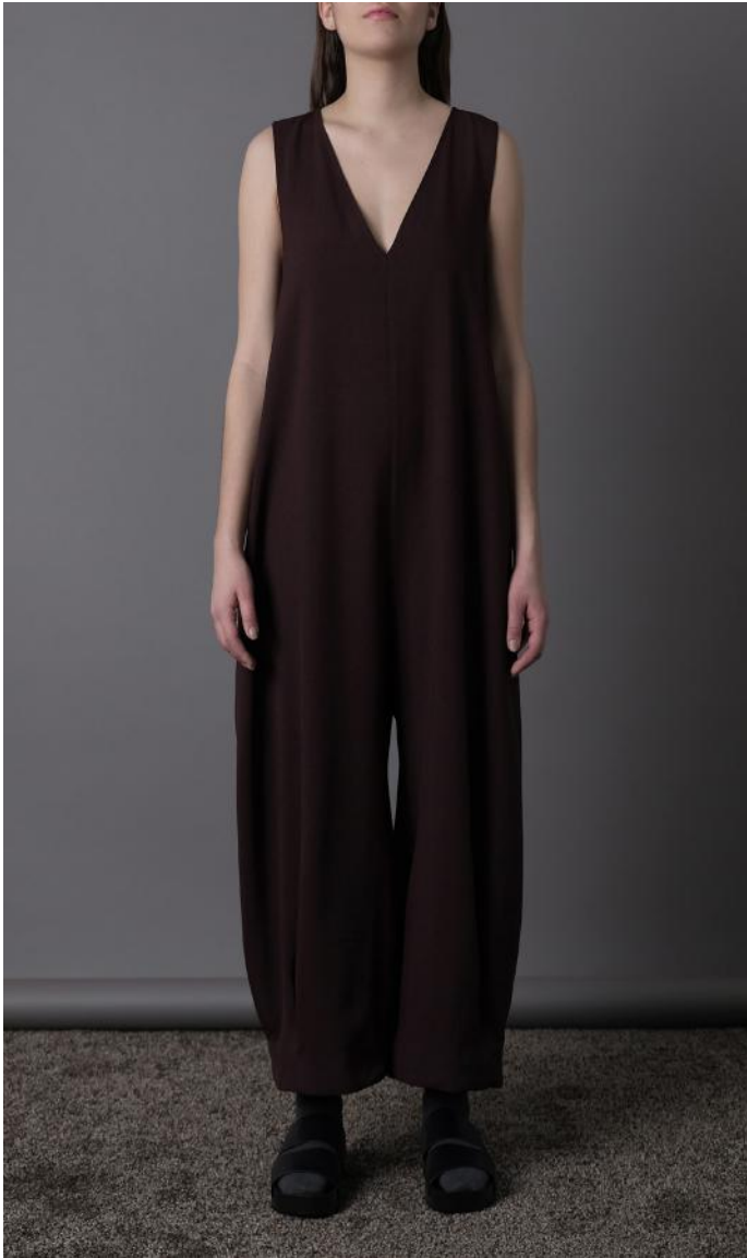
JEAN GENIE JUMPSUIT / BALANCE WEAVE