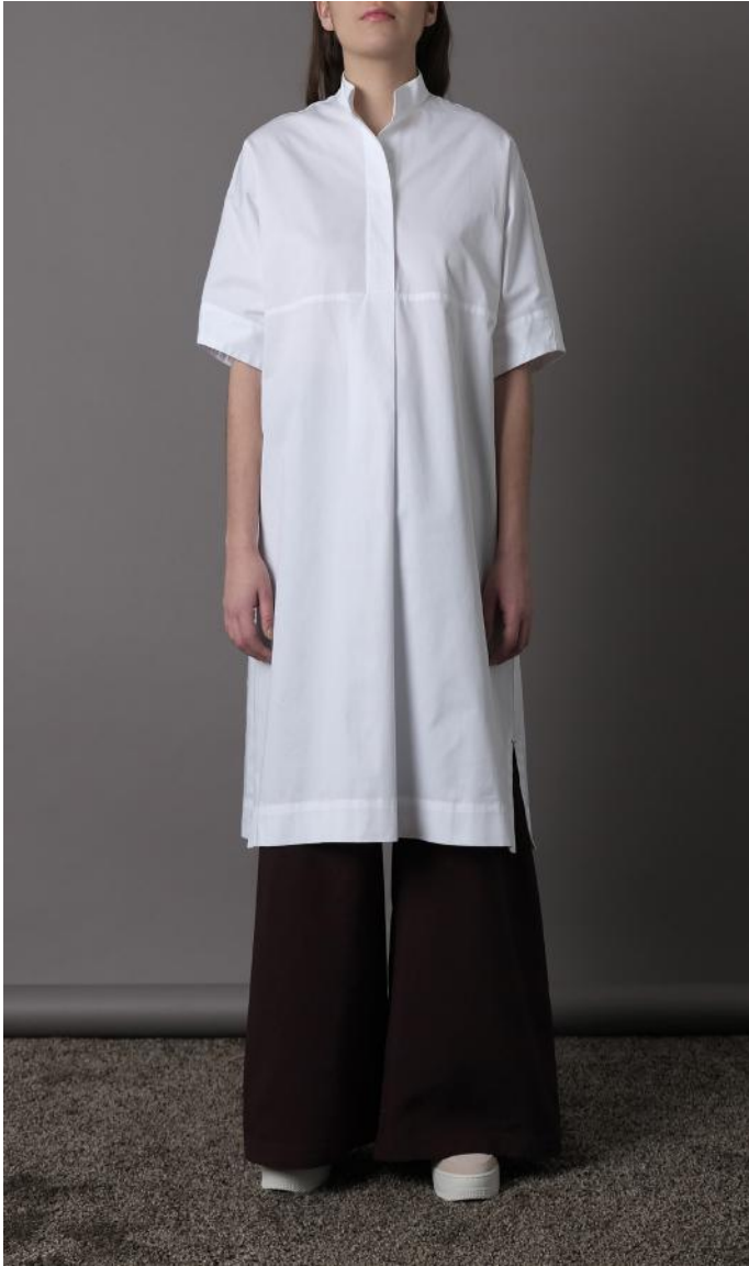
BANDED COLLAR SHIRT DRESS / FINE TWILL