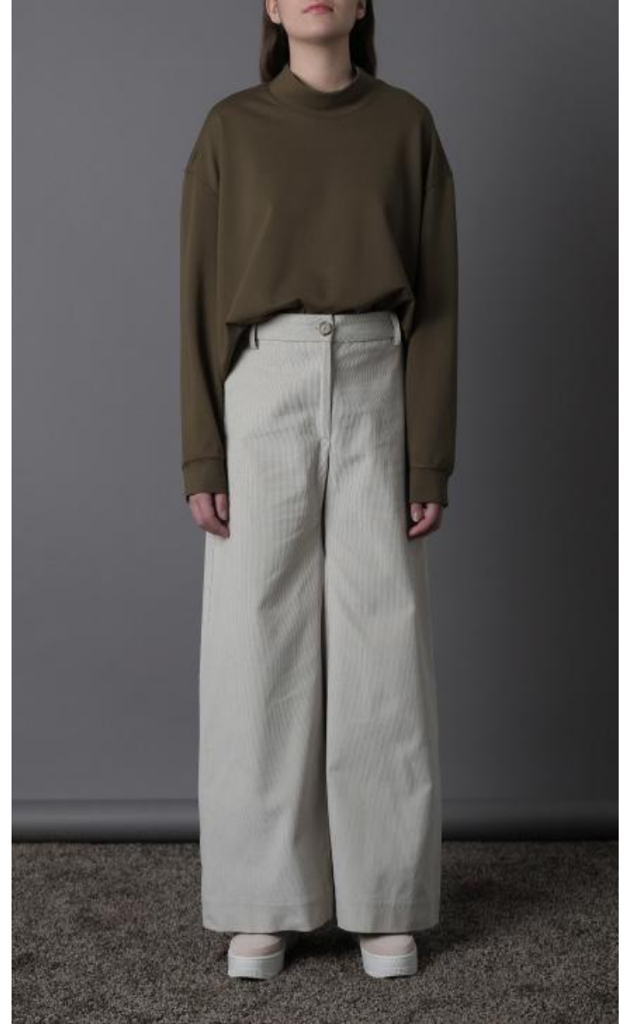
HIGH WIDE LEG TROUSER / CORDUROY