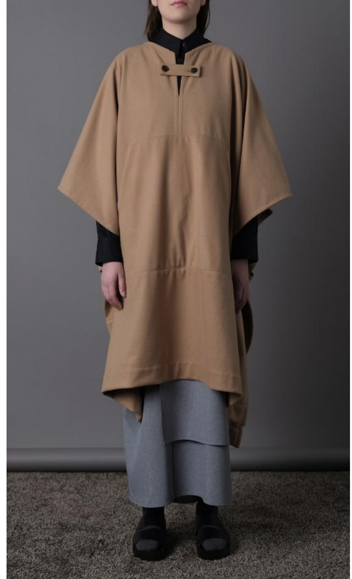
PULLOVER NOMAD PONCHO / BRUSHED FLANNEL