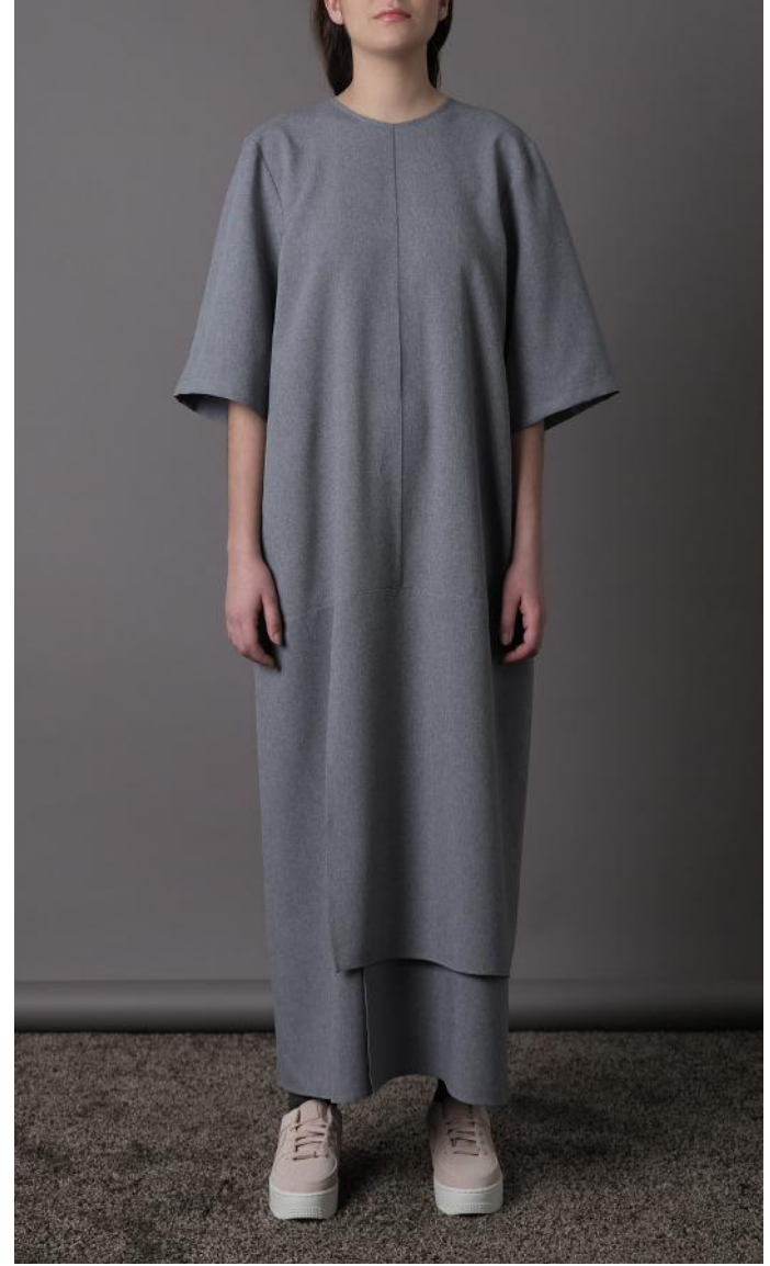
THE NEW NOREN DRESS / BALANCE WEAVE