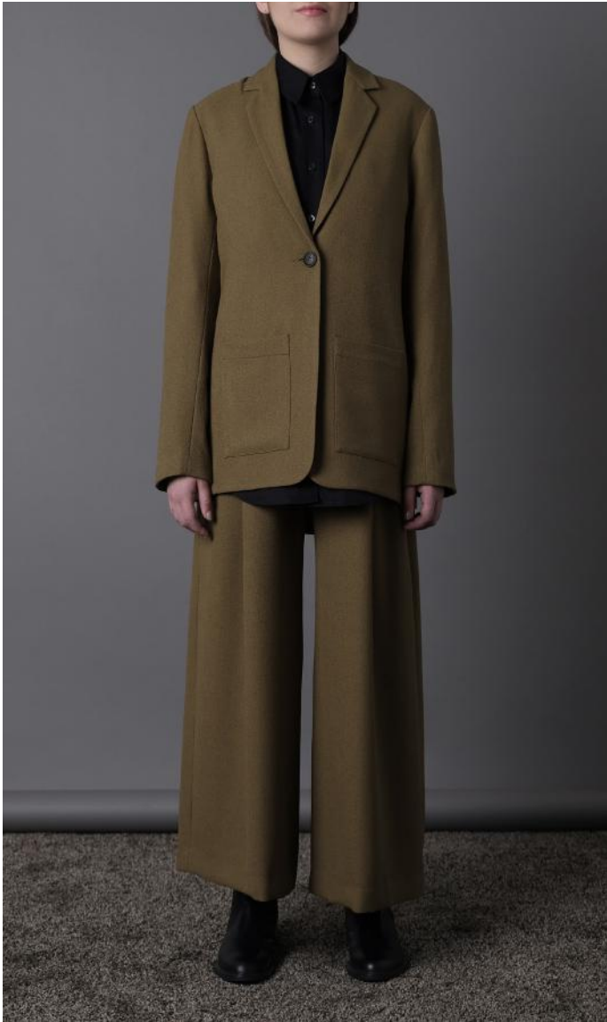
ONE BUTTON SUIT JACKET / CREPE