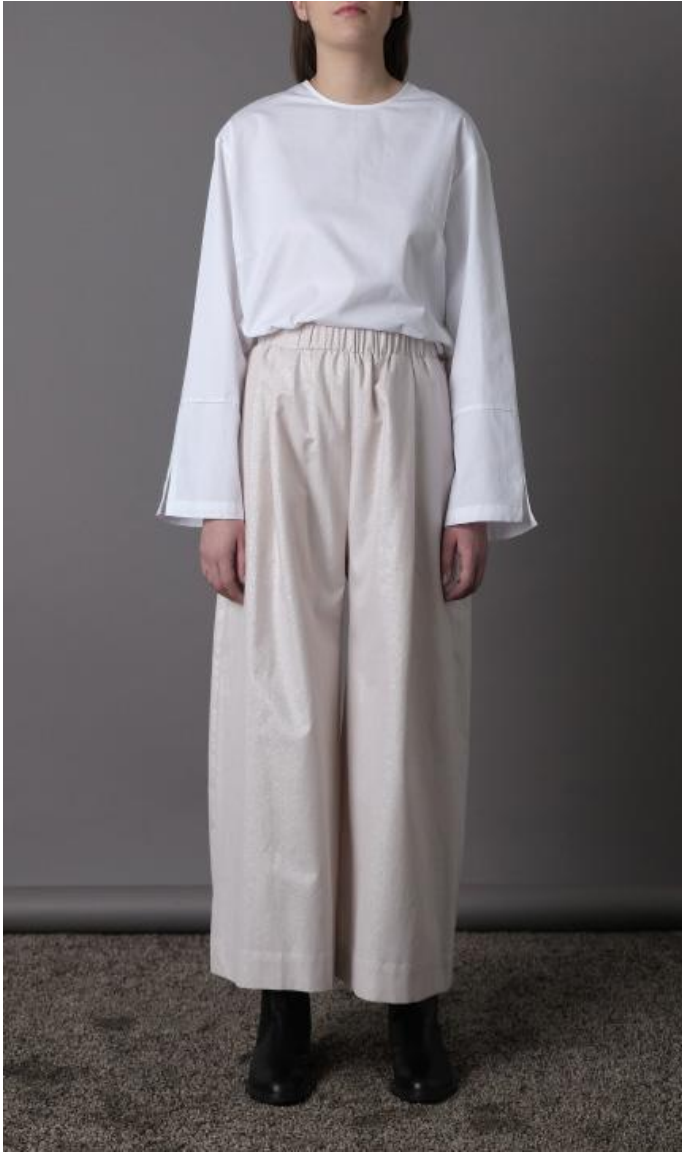
WIDE CROP PANT / FLASH CLOTH