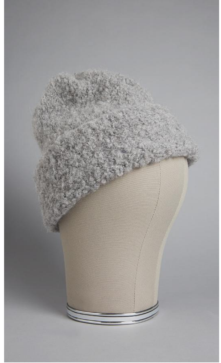
THE ANIMAL COZY BEANIE / HAND LOOM KNIT