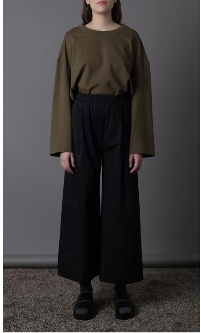
WIDE CROP PANT / FINE TWILL