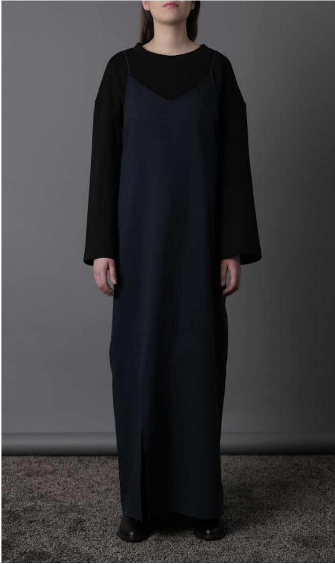
LONG LAYERED SLIP DRESS / BALANCE WEAVE