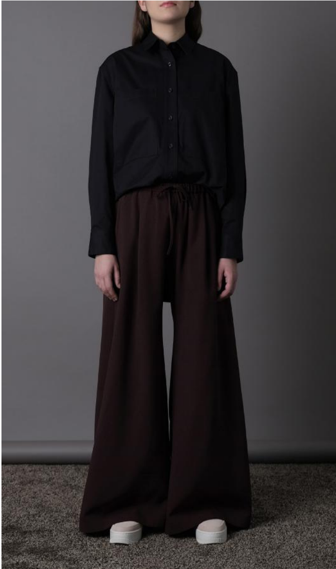
WIDE EASY PANT / BALANCED WEAVE