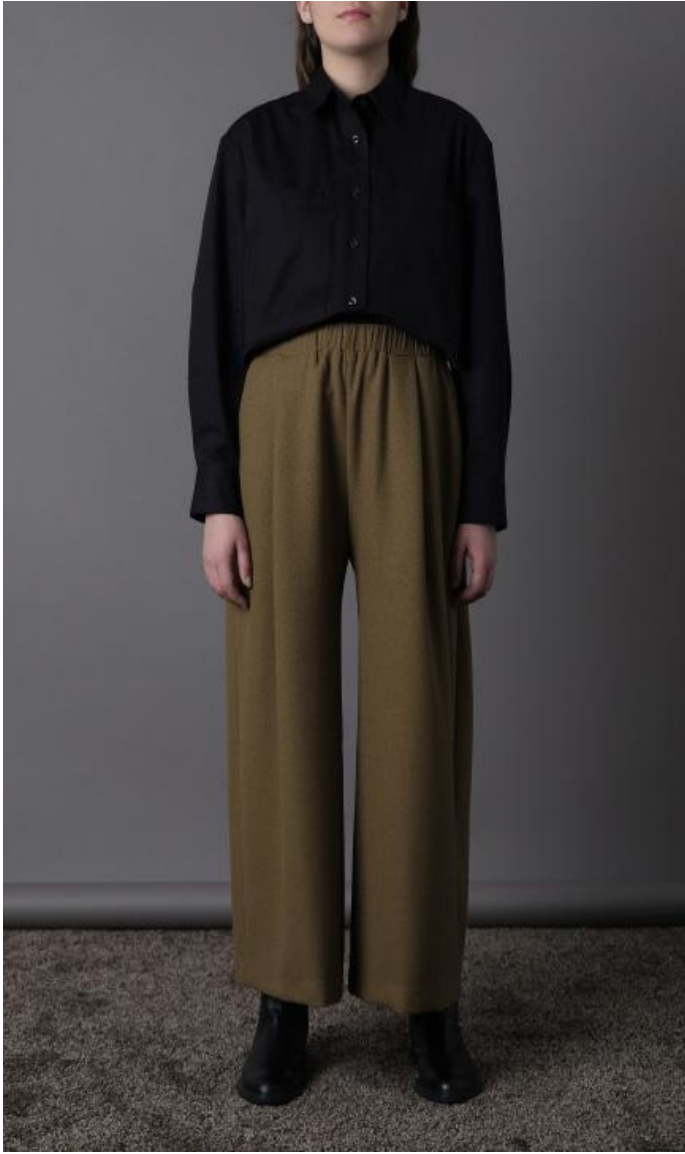
WIDE CROP PANT / CREPE