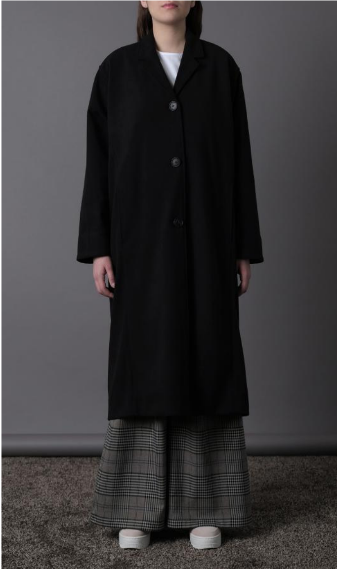
RELAXED ERRAND OVERCOAT / BRUSHED FLANNEL