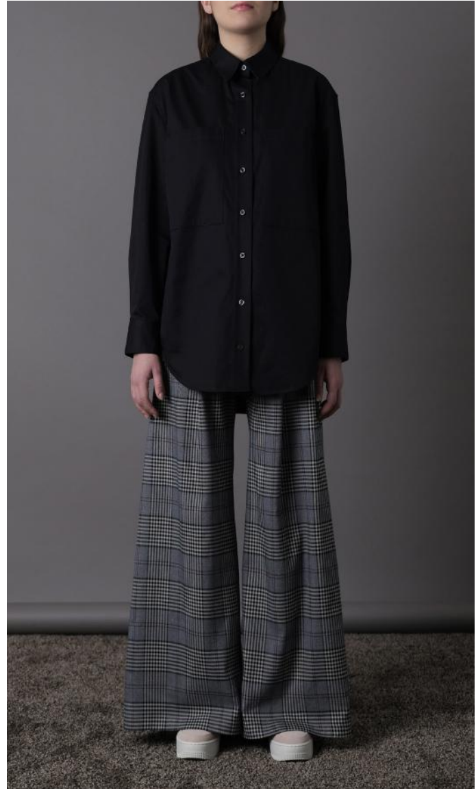
L/S TWO POCKET OVERSIZED SHIRT / FINE TWILL