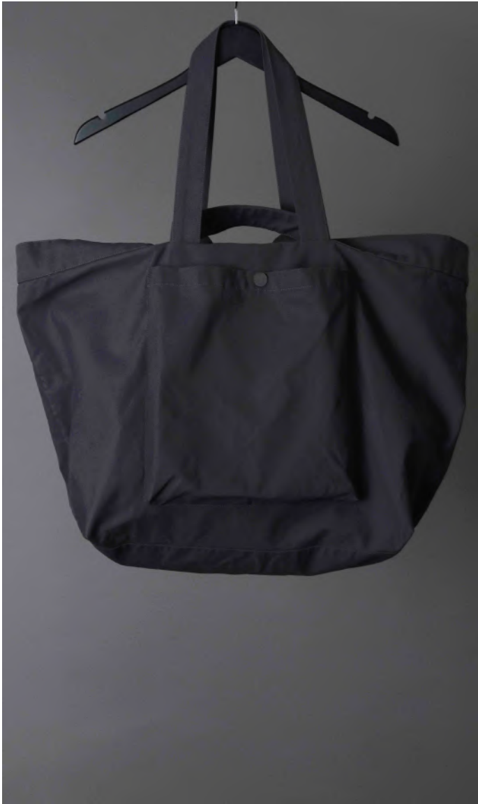
SLOUCHY TOTE / CANVAS