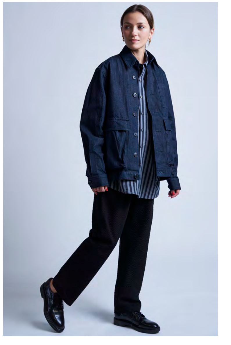
PHOTOGRAPHER JACKET / CRUSHED NLYON TWILL