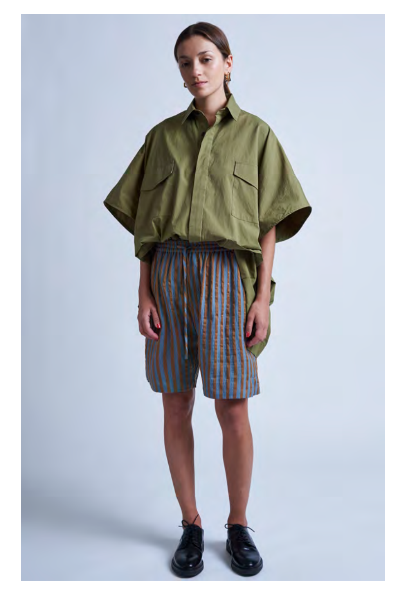
PTO EASY SHORT / WIDE RIPPLE STRIPE