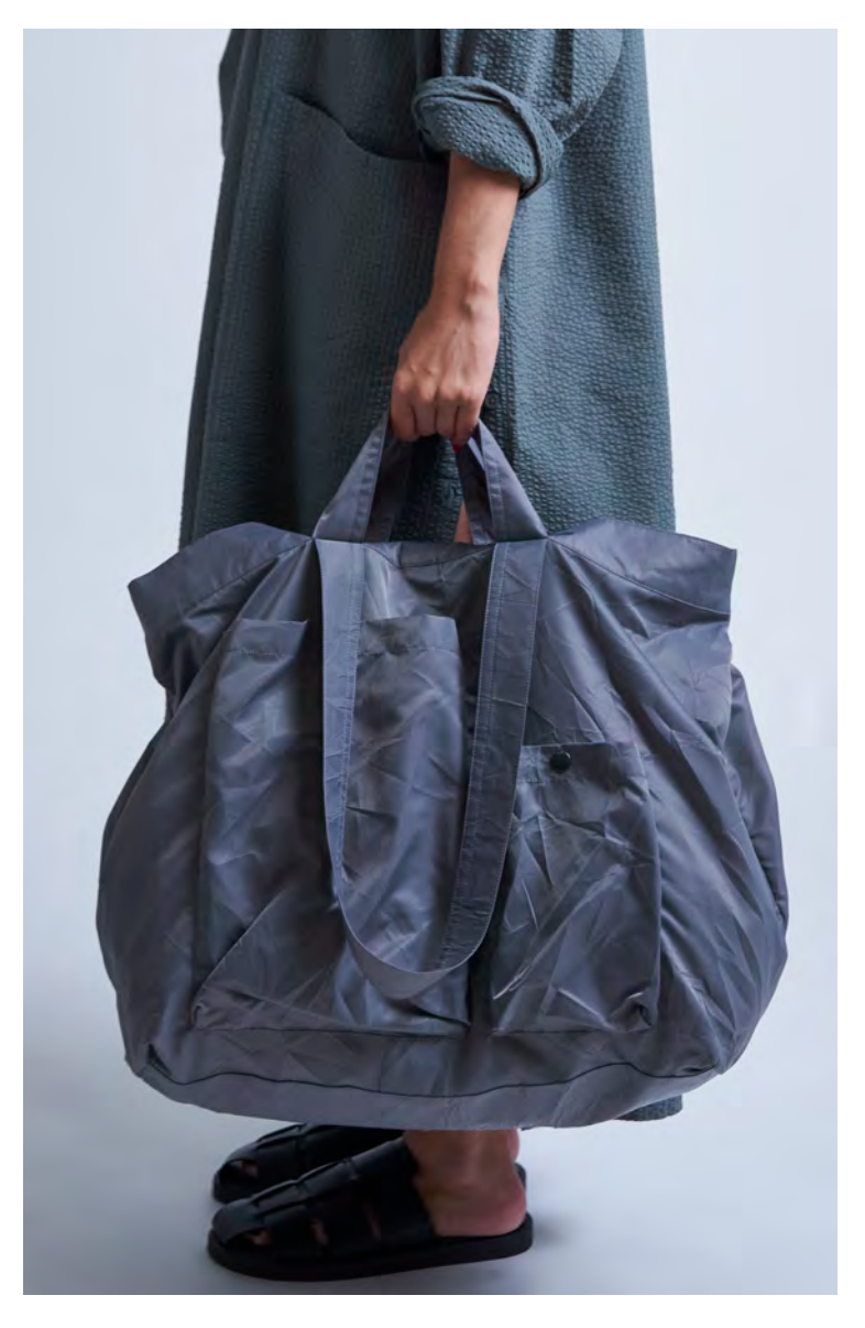
TRI POCKET SLOUCHY TOTE / CRUSHED NLYON TWILL