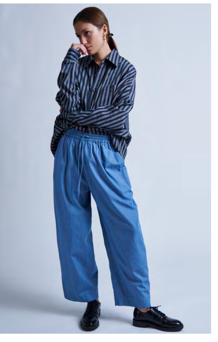
EAST PANT / SEERSUCKER STRIPE