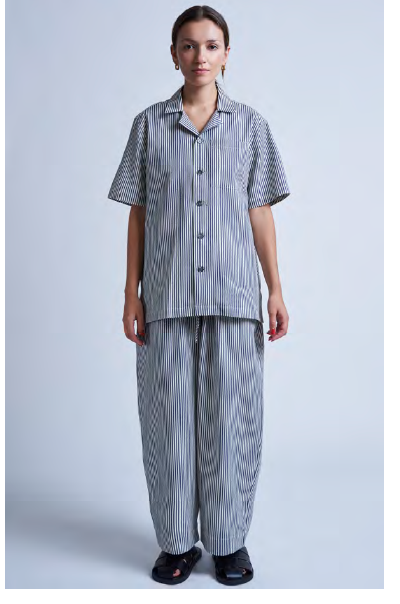
S/S PTO SHIRT / WASHED LINE DOBBY