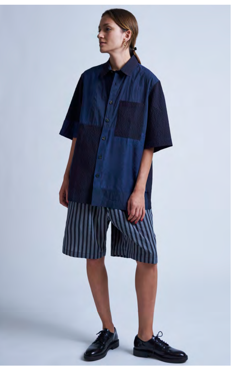
S/S PANEL BOX SHIRT / PATCHWORK