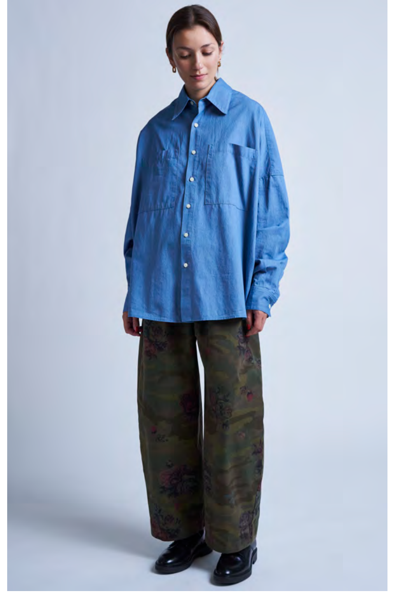
OVERSIZED 10 SHIRT / WIDE RIPPLE STRIPE