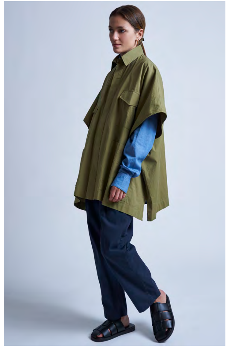
4 POCKET SHIRT PONCHO / GARDEN CAMO