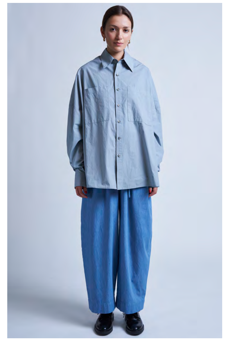
OVERSIZED IO SHIRT / ENZYME WASHED POPLIN