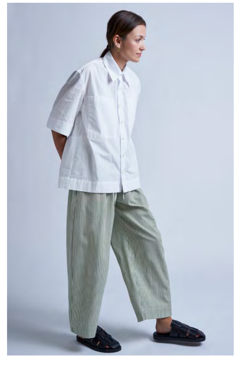
S/S MODERNIST SHIRT / SEERSUCKER CRINKLE