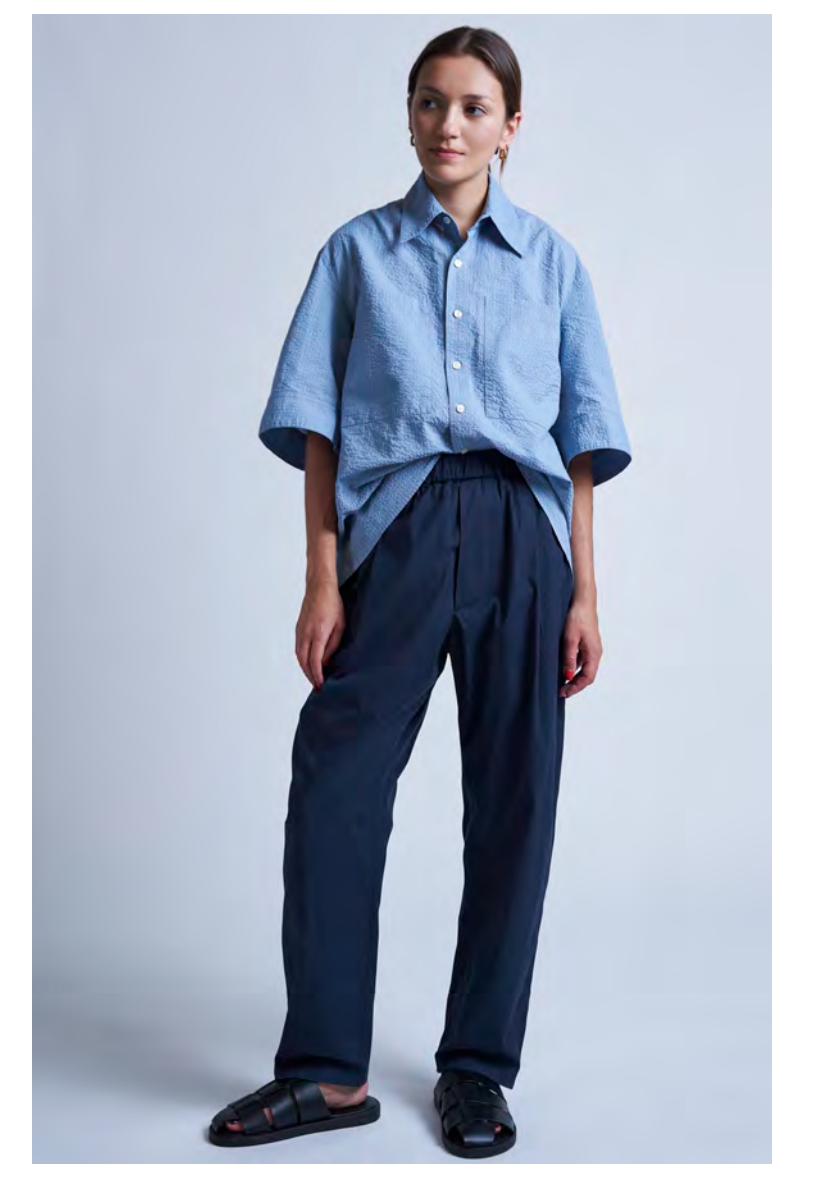
PLEATED CRUISER PANT / SEERSUCKER CRINKLE