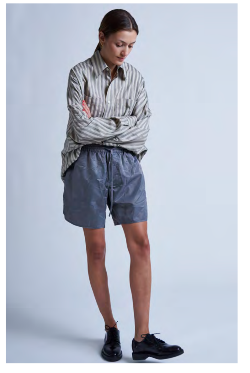
PTO EASY SHORT / SEERSUCKER CRINKLE