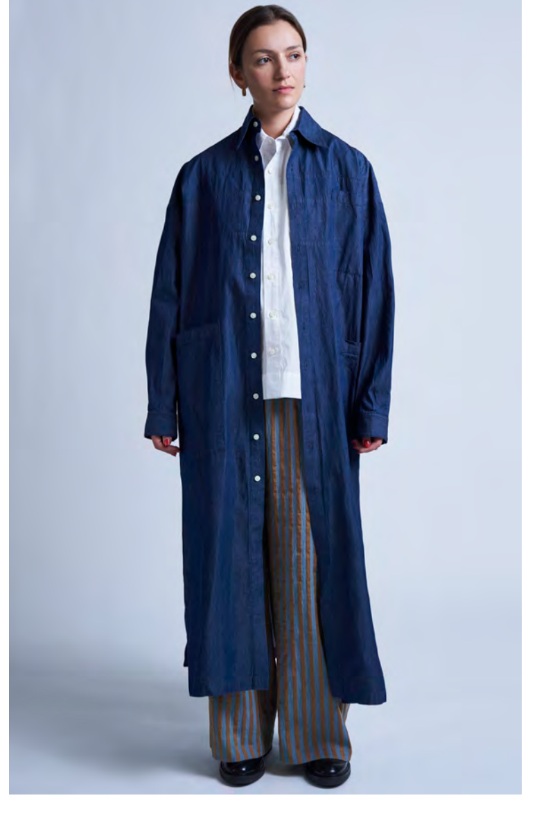
RELAXED KAFTAN SHIRT / SEERSUCKER CRINKLE