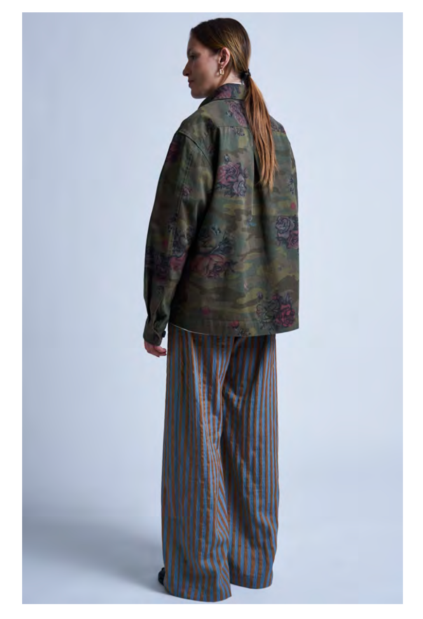
PHOTOGRAPHER JACKET / GARDEN CAMO