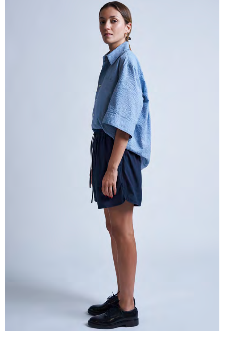
TRACK SHORT / GARDEN CAMO